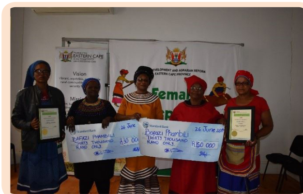
Members of the Bafazi Phambili Project holding their awards.

The Bafazi Phambili Project from Jansenville won the best smallholder and overall winner prizes. The Masibambisane Vegetable Project from the Nelson Mandela Metro won the award for best subsistence farmer. Prizes ranged from R5 000 to R30 000. Contestants also received an award each for their continued hard work. The DRDAR encouraged women to take farming seriously, as it is an important part of the economy that can help to reduce unemployment.