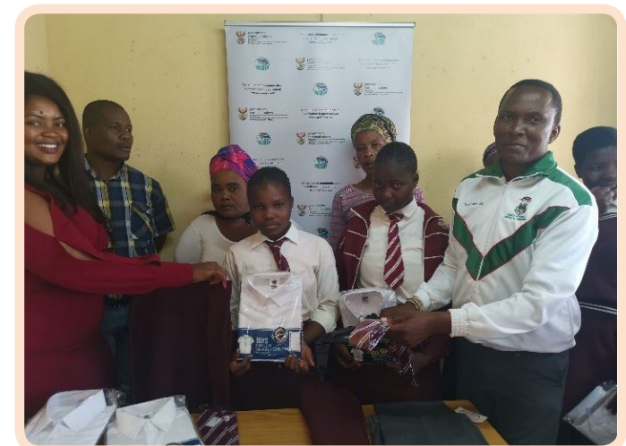
Learners and their parents receiving school uniforms during the handover ceremony.