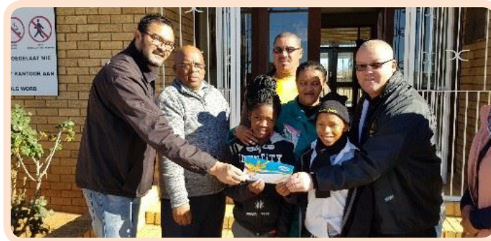
Officials handing over school uniform vouchers at one of the primary schools visited.

After visiting the schools, the officials proceeded to local neighbourhoods where they did home makeovers for houses that needed improvements. They painted houses and repaired broken windows. They also donated household necessities such as blankets.