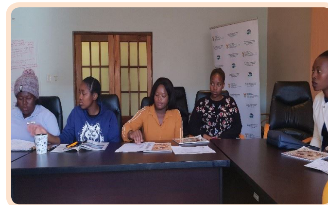
Stakeholders and community members attending the dialogue on drug and substance abuse.