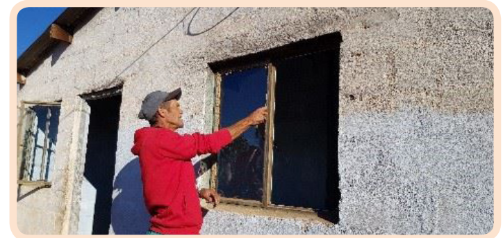
A volunteer replacing broken windows at one of the houses.