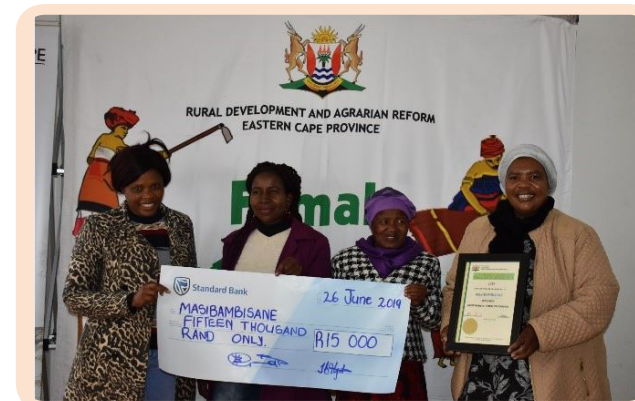
The Masibambisane Vegetable Project members.