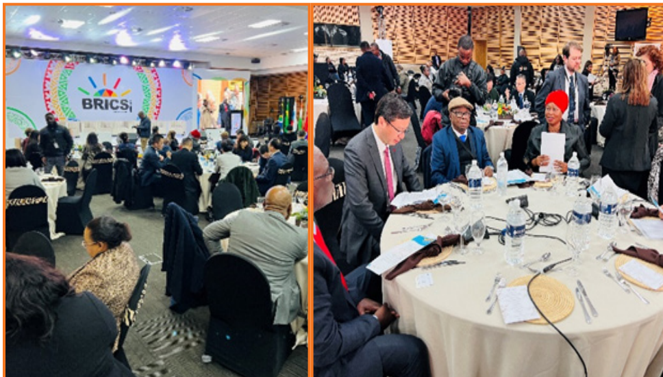
Members of the BRICS and senior officials during at the meeting.

The BRICS Ministers of Education welcomed the invite by South Africa and vows to work together to enhance education.