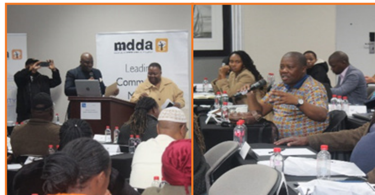
Stakeholders presenting and engaging at Garden Court.

"To our beneficiaries, we will continue to enable access to information to communities in languages they understand," said Mathebula.