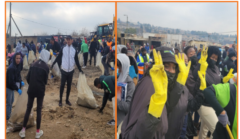
Kya Sands Stakeholders Forum members, volunteers and members of the community hard at work.