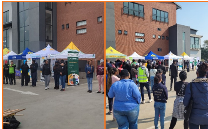
All stakeholders and volunteers who were part of the clean-up project.

For a more impactful campaign, all stakeholders members had on 21 June, visited the area to mobilise community members to join in and assist on the day of the campaign and to encourage them to be part of the programme as a form of bringing a sense of inclusion, responsibility and accountability. Through proper planning, organisation and mobilisation, the event had more support from volunteers, community members and other private companies that brought about a positive mood and success to the project.