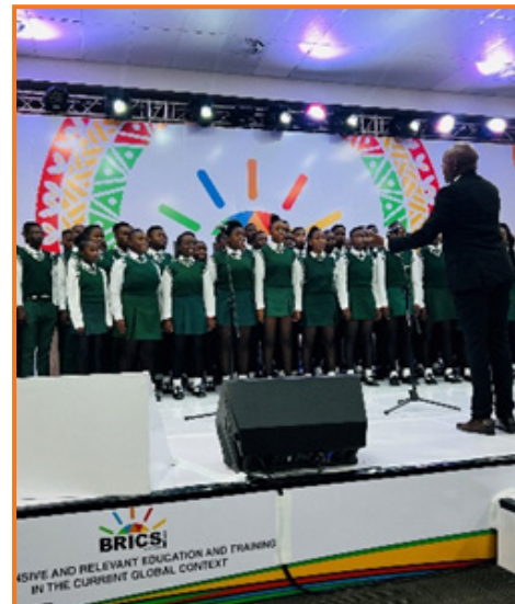
Learners welcoming BRICS members.