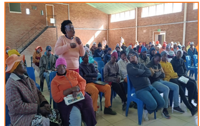
A community member participating in the dialogue.