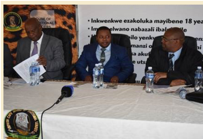
► MEC Fikile Xasa, King Azenathi Dalindyebo and Deputy Minister Obed Bapela at the briefing.

The 2018 Winter Initiation Season in the Eastern Cape began on 12 June. Government has pledged to make the initiation season safe. This commitment was pronounced by Obed Bapela, the Deputy Minister of Cooperative Governance and Traditional Affairs (CoGTA) in unison with traditional authorities in the province.