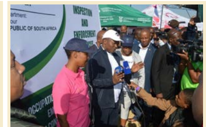
► The Deputy President addressing the youth in front of one of the stalls at the event.