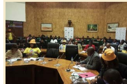
► Young people who attended the dialogue with Deputy Minister Pinky Kekana.