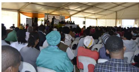
► Community members at the prayer meeting.

"We should support government programmes like this one and work together with the police to stop crime. People are very poor, there is high rate of unemployment, yet many people want to live the high life, which leads them to crime. To stop crime, government must help create more jobs especially for the youth."