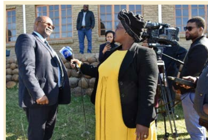
► Deputy Minister Obed Bapela addressing the media.

This falls on the backdrop of a sorrowful Summer Initiation Season where the Eastern Cape regrettably recorded 17 lives. The Deputy Minister therefore saw it very fitting that resources and