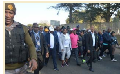
► Deputy President David Mabuza leading the 3km walk.

The 3km Youth Walk on 23 June 2018 started in Joubert street to the A.J Swanepoel Stadium. The Deputy President and Deputy Ministers were joined by more than 2 000 young people. Deputy President Mabuza urged to take the initiative to improve people's lives. He further responded to the issues raised by the public regarding their everyday challenges. A range of information products from various government departments and institutions were exhibited and shared with the youth at the event.