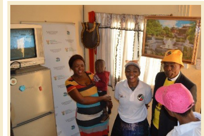
► Deputy Minister Kekana joined by Deputy Ministers Stella Ndabeni-Abrahams and Madala Masuku at one of the youth household beneficiary explaining the DTT programme.