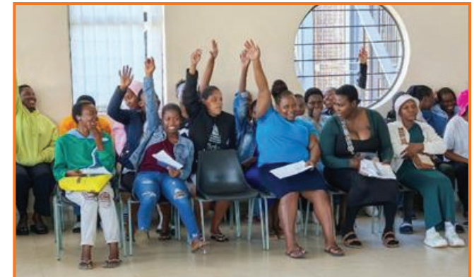
Students engaging with the programme and eager to give inputs.