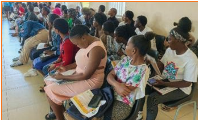
Students attending the G20 Academia Programme.

There is a need for repeat visits to workshop students on skills to compile a curriculum vitae, job hunting tactics and other related matters. The programme was well received by students since they better understood the what G20 means to them and how it is related to courses offered at the campus.