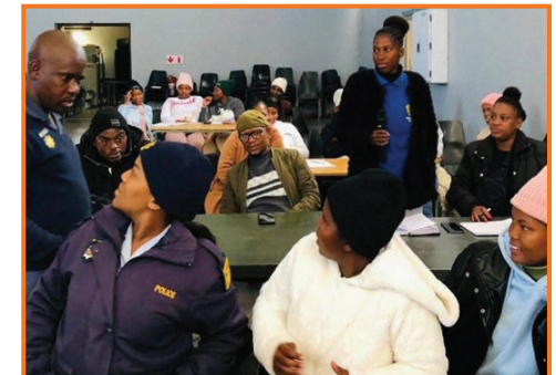
Youth engaging in a question-and-answer session.