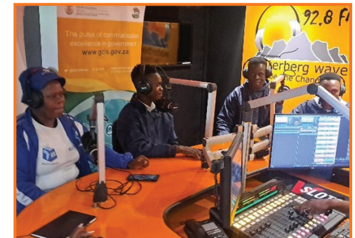
The youth share their views on elections and the importance of voting.