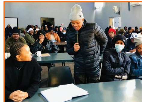
Youth participants from various police stations who attended the programme.