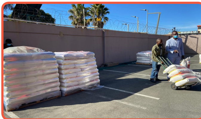
The wheat donated by the SAB.