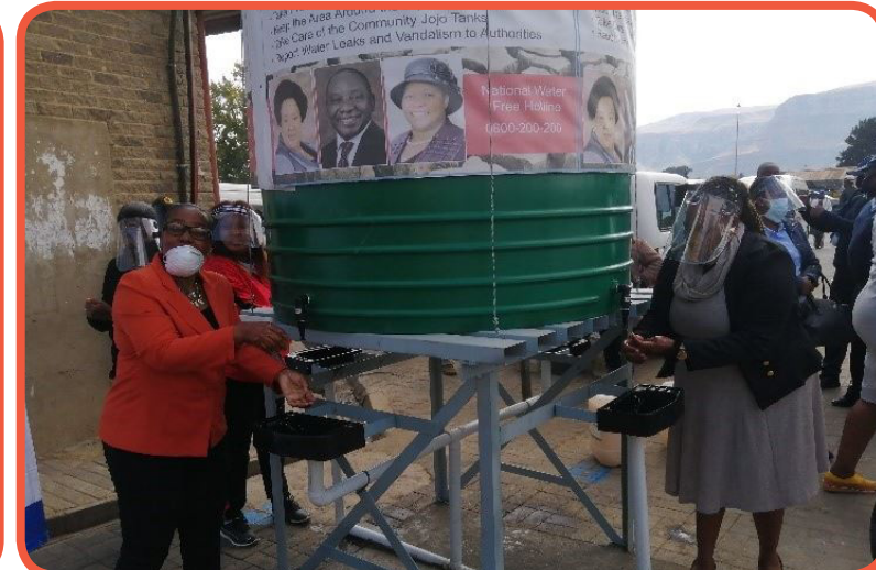
Members of the mayoral committee washing their hands at one of the water stations.