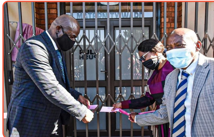
Premier Zamani Saul, MEC Mase Manopole and Sol Plaatje Executive Mayor Patrick Mabilo officially opening the renovated maternity ward.

In an effort to respond to the spread of COVID-19, government also installed a sanitation booth and a stand-alone infrared thermometer for the health personnel and patients.