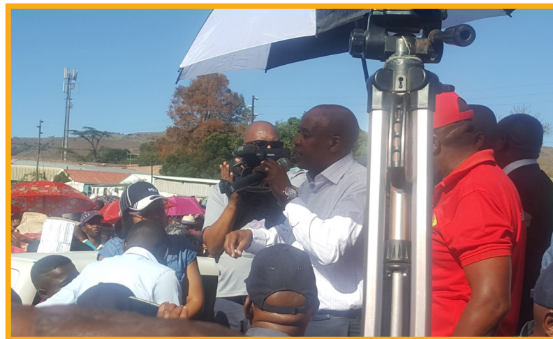
Premier Masualle engaging community members of Engcobo.

Premier Masualle thanked the community for a peaceful protest, which did not involve destroying municipal offices/assets and other public properties such as schools and clinics, as these are spaces that communities attack to express their frustrations.