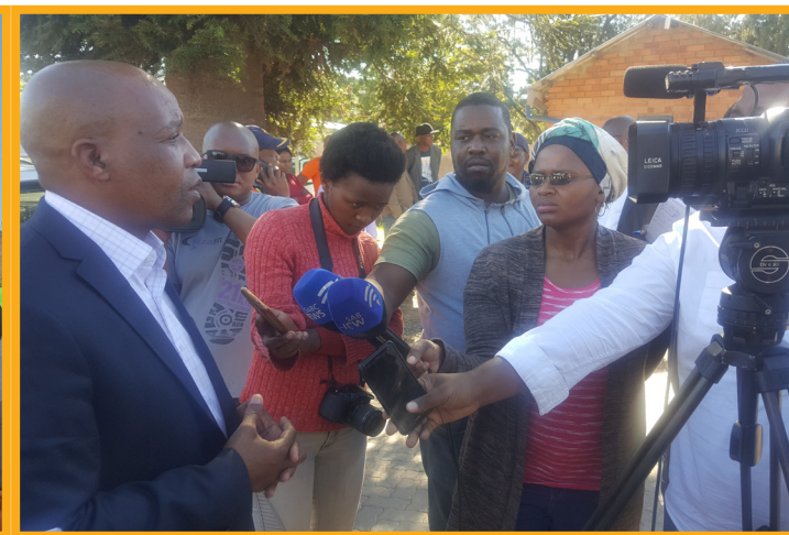
Premier Masualle being interviewed by the media.