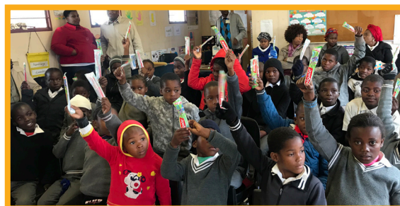
Learners received toothpastes and toothbrushes.