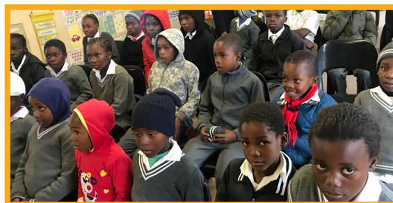
Learners at the event.