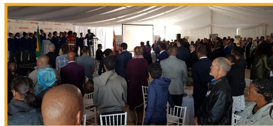
Stakeholders and community members at the event.

The Xina Solar One plant was hailed as a milestone achievement towards the provision of clean renewable energy during the official opening of the plant by the Minister of Energy, Jeff Radebe, in Pofadder on 18 May 2018. The Xina Solar One is the third solar project in the Namakwa region and the sixth in the Northern Cape to be fully functional, each contributing more than 100 megawatt of "clean" electricity to the national grid.