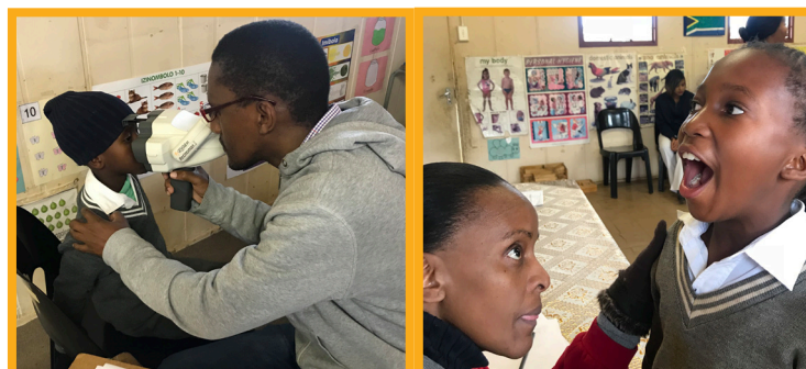
Health screening session at the event.