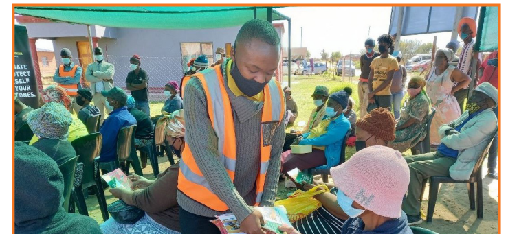
COVID-19 information leaflets were distributed to community members.