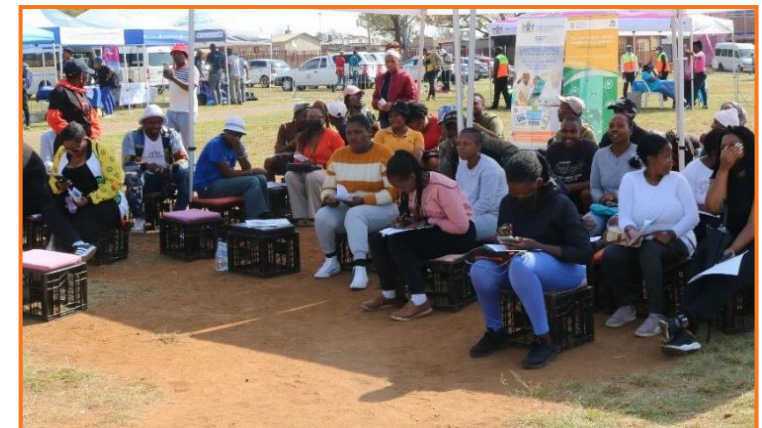
Youth visiting information stalls and listening to presentations during the Workers' Month awareness blitz.