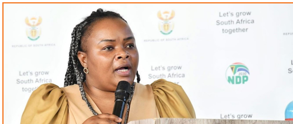
Deputy Minister Thembu Siweya addressing the Vuwani community.

The government initiative of conducting GBVF and the service fair was highly appreciated by the communities and community structures as it gave them an opportunity to raise issues affecting their daily lives and also how GBVF can be addressed in their communities.