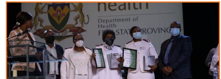
Nurses being recognised for their outstanding work.

Nurses who lost their lives in the line of duty were also remembered and honoured at this ceremony.