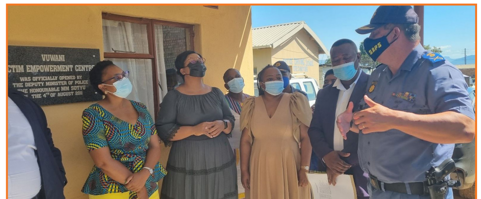
A member of the South African Police Service interacting with community members.