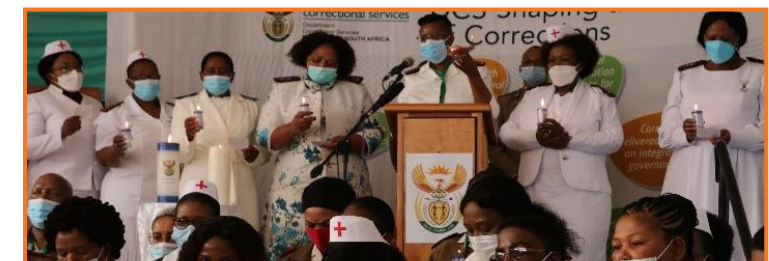
Department of Correctional Services nurses reiterating their Pledge of Service during their Commemorative Day at Groenpunt.