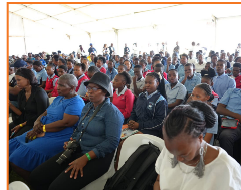
Community members during the launch of the SA Connect Phase 2 Project at the Ephraim Mogale Stadium.