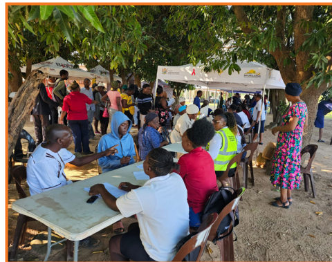
Members of the community undergoing their health screenings for high blood pressure, diabetes, HIV and other non-communicable diseases. People were taught about the importance of the Cheka Impilo wellness campaign. MMC Vuma, MEC Manzini and Acting Chief Shongwe led by example by openly participating in health screenings.