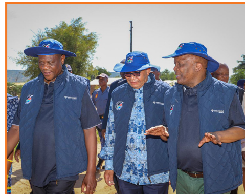
Deputy President Mashatile, Minister Gungubele and the Premier of Limpopo, Mr Stanley Mathabatha, during the launch of the SA Connect Phase 2 Project.

Thanks to the SA Connect programme, the Modimolle community is now part of the digital world.