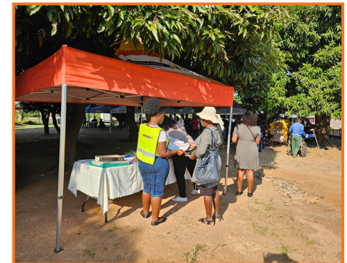
GCIS officials disseminating government information to community members and marketing the Matsamo Thusong Service Centre.