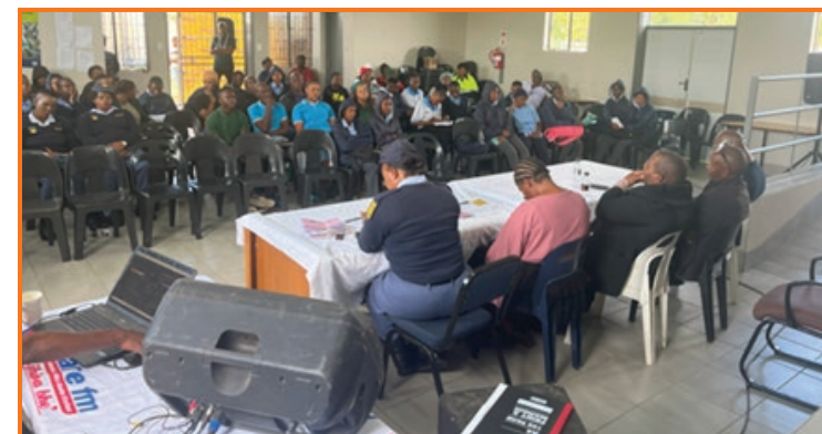
GBVF dialogue at Mandela village in the Thembisile Hani Local Municipality.