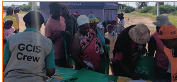
The GCIS team and stakeholders distribute information material to community members.