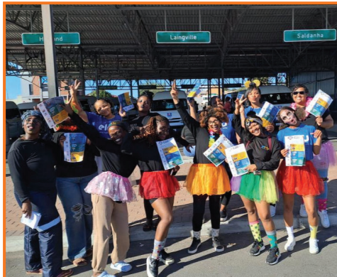
The activation team comprising ELRU volunteers, was very excited to share information on G20 with the public.

The activation was well received, with the public expressing their appreciation for government's efforts, and successfully highlighted the importance of civic education and the value of bringing national conversations to local spaces.