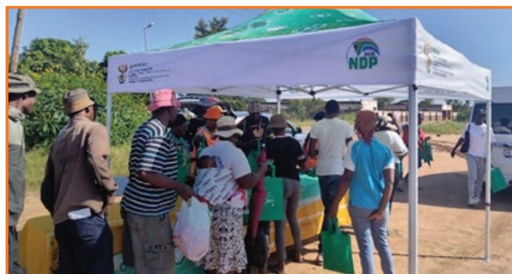
Community members receiving government information material during the Freedom Month outreach in Hammanskraal, at the Selemela Sports Ground.

Community members around Hammanskraal urged government to continue with such programmes, as they empowered them on issues such as GBVF and matters involving the Lesbian, Gay, Bisexual, Transgender, Queer and Intersex community.