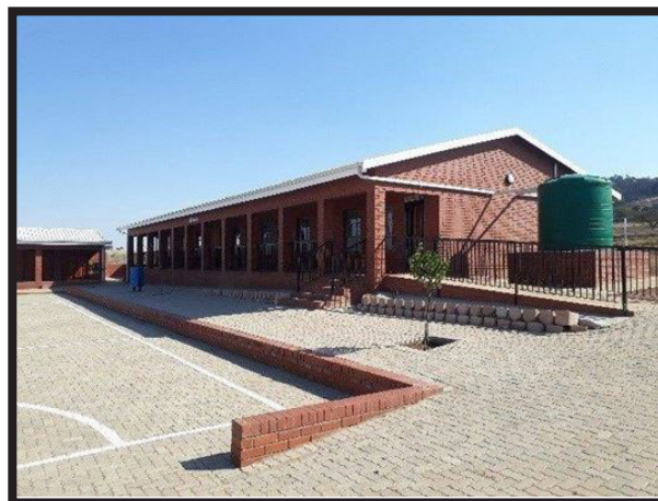
One of the new schools