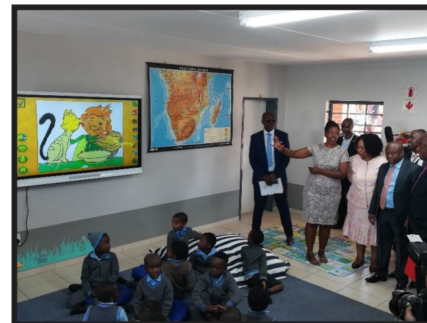
The interior of one of the schools.