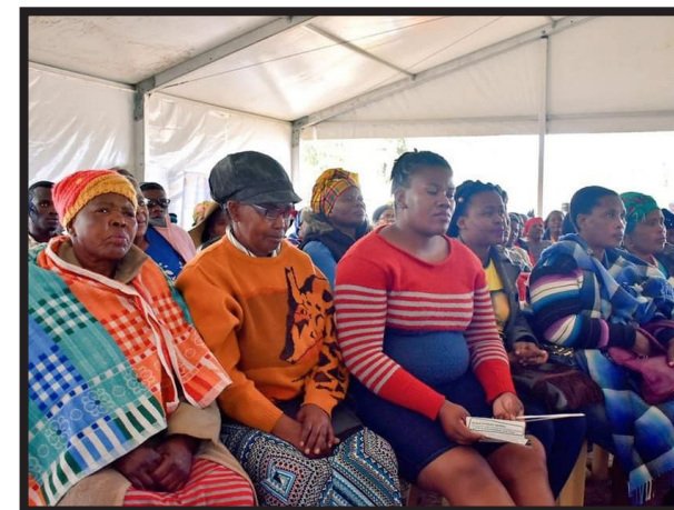
Community members of Sterkspruit who attended the Imbizo.