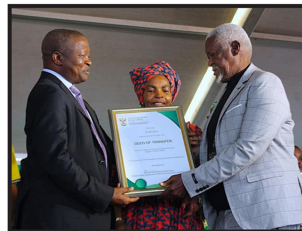
Deputy President David Mabuza and Minister of Rural Development and Land Reform, Maite Nkoana-Mashabane, giving title deeds to community representative.