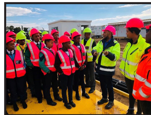
Learners during a tour at Belfast Exxaro Mine.