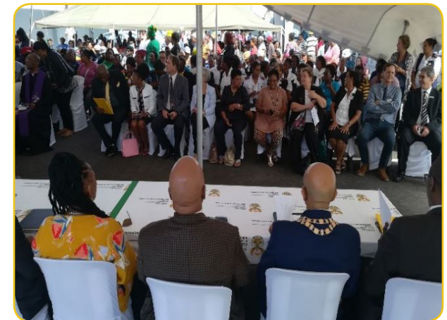
Minister Jeff Radebe, other government officials and community members at the event.