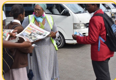
Distribution of information materials to commuters.