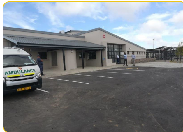
The newly built Asla Clinic in Mossel Bay.

The dental unit at Alma Clinic is now closer to the community, saving the community from travelling long distances to the provincial hospital to access these services. The D'Almeida extension has increased the service offerings of the clinic, which now include an in-house pharmacy and a consulting room. A total of R23.9 million was invested in the three projects.