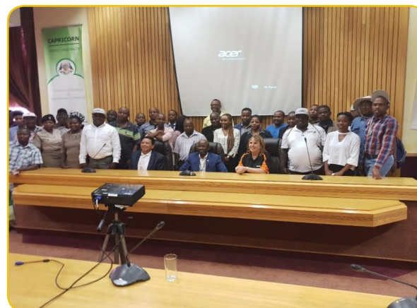
Attendees at the event.

Delegates from different community media also raised their concerns and challenges that affect them at their respective media houses. One of those was local media's sustainability and support from government. It was proposed and supported that community media should be assisted with more training by NEMISA and the MDDA so that they are well positioned in the industry.