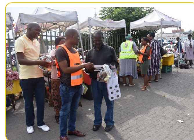
Community members accessing information products.