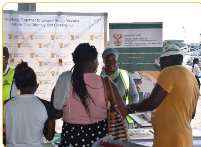
Government officials interacting with community members.

The event targeted people who visit the city and do not get government information on a daily basis. The departments shared information on their respective efforts to mitigate some of the challenges faced by the community. Community members were also given information concerning the upcoming local elections.