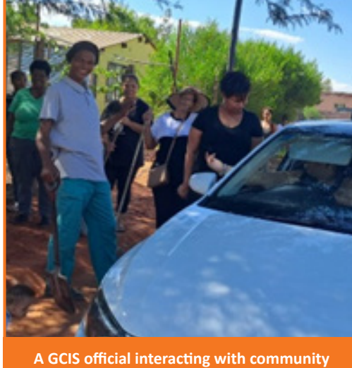
GCIS official interacting with community members.