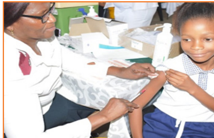
A health official vaccinating a learner during the outreach.

MEC Sambatha urged Department of Health officials to work closely with the Department of Education to ensure that all learners are vaccinated for measles other diseases. He further explained the campaign is not just for statistics, however, to protect themselves against diseases. He also urged parents to cooperate with both health and education officials in order for the campaign to be a success.