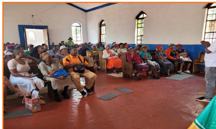
Community members from Alexandra Ward 108 in attendance.

The dialogue involved stakeholders introducing their organisations, services they offer and their role in the community. Behavioural change of the abusers in the last 12 months, main areas that people feel vulnerable or at risk of GBV, the environmental risks, improvement on safety for the community, optional help services for GBV victims, available GBV interventions in the community were discussed among others. The communities were told how helpful the interventions are and discussions included improvement of existing GBV services, ensuring that people continue to get services, suggesting interventions and community support. Though challenging, the interventions by both local stakeholders and community members has proven to improve the state of GBV in the community.