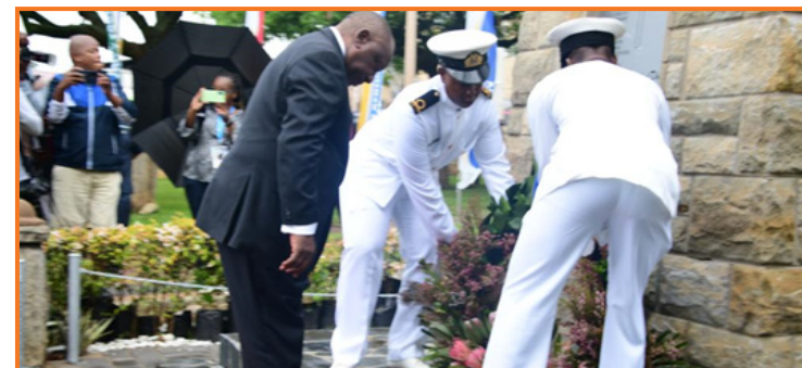
Wreath-laying ceremony by President Cyril Ramaphosa.

The programme included the laying of the wreath by President Ramaphosa at the Empangeni World War II monument, and awards of recognition to family members of those armed forces members who died in the line of duty to protect and serve the nation.