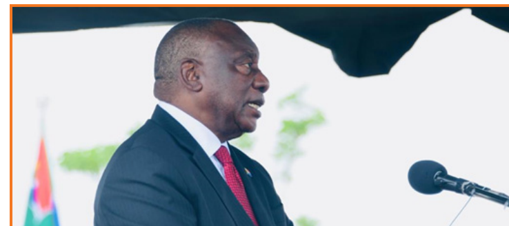
President Cyril Ramaphosa addressing the audience.