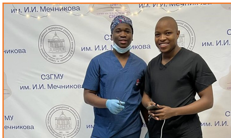
Stakeholders engaging the attendees during the Central Karoo Rural Safety Summit.

“Learners need to give all their school subjects equal attention as all the school subjects are important for their educational development,” he stated.