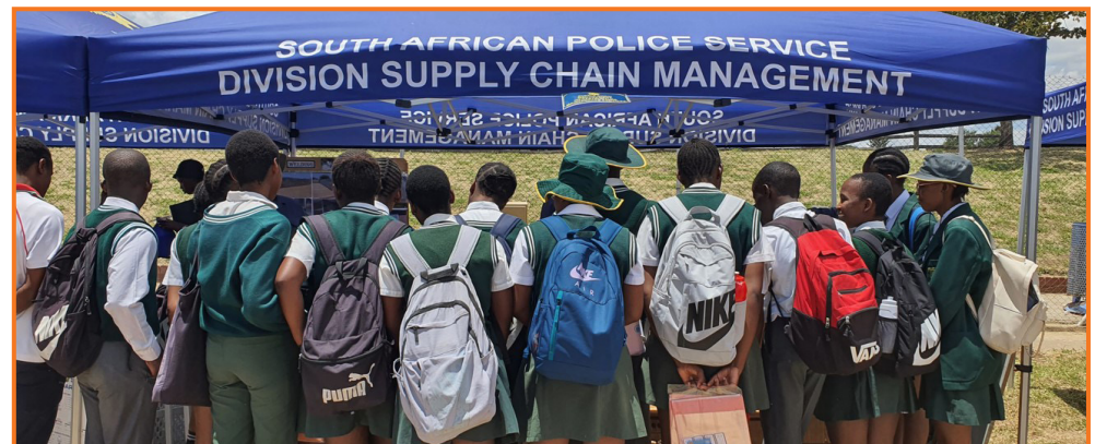
Learners visiting one of the many SAPS exhibition stalls at the career expo.