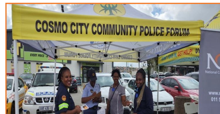
Cosmo City Community Police Forum engaging with community members during the campaign.