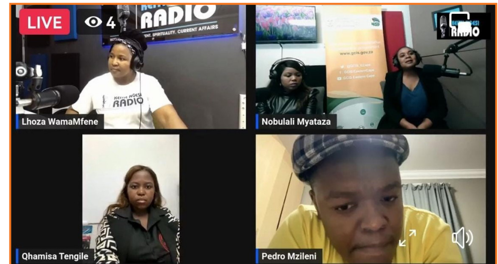
Panellists reflecting and engaging on the speech during a radio discussion.