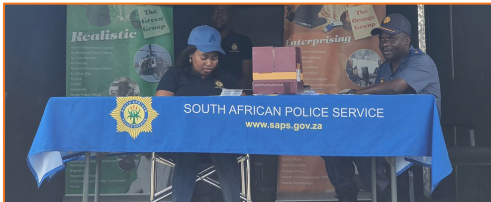
SAPS exhibition at the career expo.

This career expo created an atmosphere that provided the Grade 12 learners and first-year students with opportunities that they thought were out of their reach.