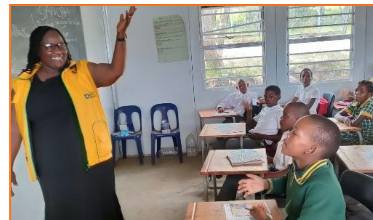
Stakeholders sharing content on GBV and substance abuse.