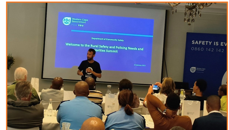
Stakeholders engaging the attendees during the Central Karoo Rural Safety Summit.