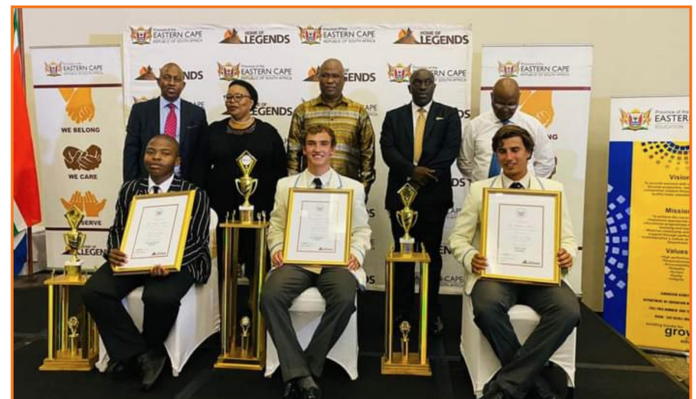
Eastern Cape top-three achievers and the provincial leadership.