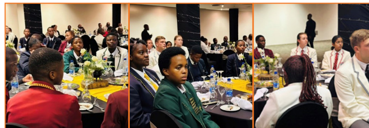
Provincial top achievers from various schools and districts of the Eastern Cape.