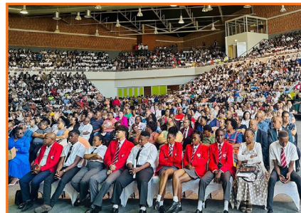
Community members and some of the top achievers during the public announcement of the matric 2023 results.