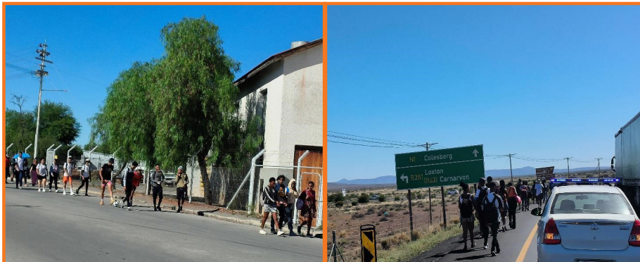
Grade 12 learners walking through their community and on the Loxton Road to the Karoo National Park.