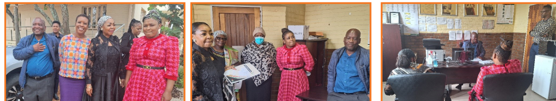
Deputy Minister Pilane-Majake during her visit at the Moletši Thusong Service Centre.

"It shows that our contribution in the Thusong Service Centre programme goes noticed. We are also proud to share our good practices with the Deputy Minister and we hope that the challenges faced by our centres will be attended to," added the Capricorn District Executive Mayor.