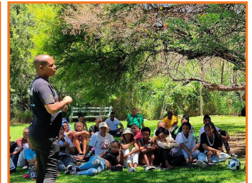
An official from Partners in Sexual Health addressing the audience.