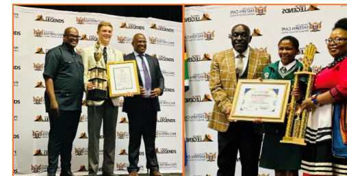
MECs and the Premier awarding some of the provincial top achievers.