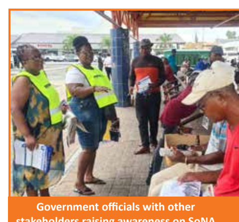
Government officials with other stakeholders raising awareness on SoNA at the Upington taxi rank.

The GCIS office was also joined by the IEC to promote the second Voter Registration Weekend and encourage first-time voters to register to vote on the different platforms available. The IEC reminded the residents about the importance of voting in the upcoming provincial and national elections.