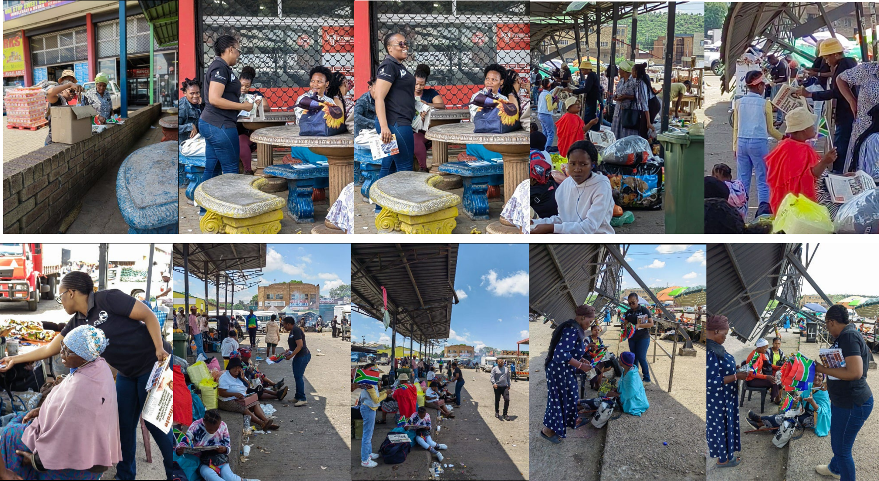
GCIS officials engaging with the commuters in Marabastad taxi rank and Bus Station.