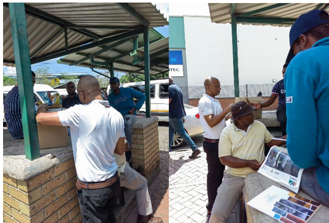
GCIS officials interacting with the community members in Bosman Taxi rank during the activation to make awareness of safer holidays and to encourage them to stay safe on the roads.