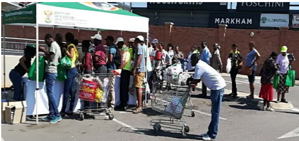
Consumers engaging with the exhibitors and queuing to collect information material.