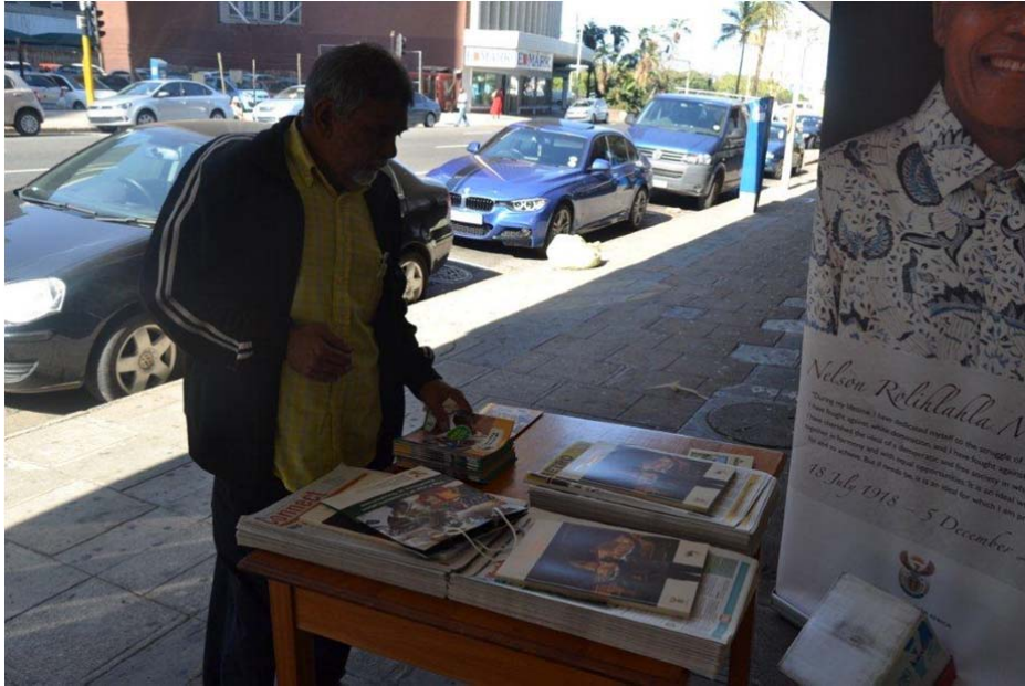
Above and below: Members of the public take information material from the GCIS stand