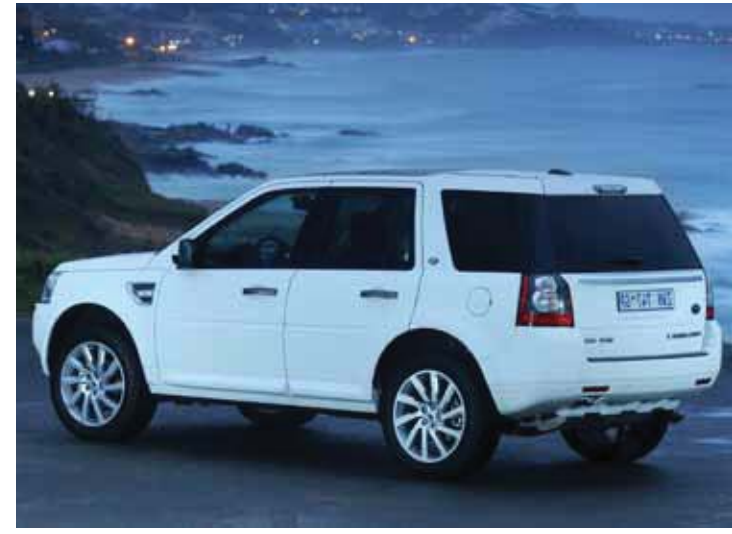
Range Rover Freelander SE Diesel

Favourite multi-purpose vehicle (MPV): Call me what you want, but I have to admit that when it comes to an MPV, nothing beats the cosseting comfort of an American car. They know how to do luxury in a big way. When I retire, I am gonna get me one of 'em Chrysler Voyager 3,8 Ltd Automatics. That's right, the petrol version, so I'll bust my pension on travel costs! At least I will go down smiling. 2nd choice: The Nissan Qashqai 4x4.