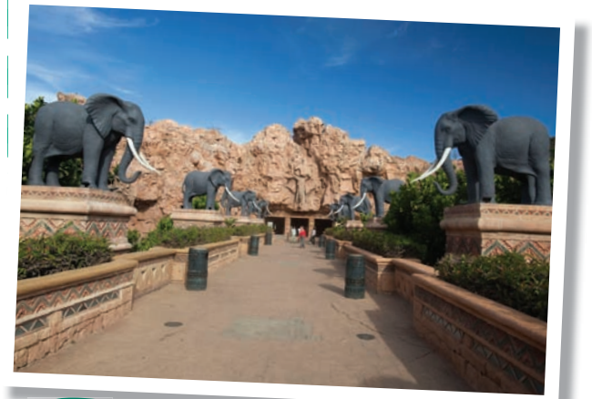
North West Capital: Mafikeng Principal languages: Setswana, Afrikaans, isiXhosa

his is a province of varied attractions, picturesque dams and dense bush. The North West promises the complete package for any tourist.