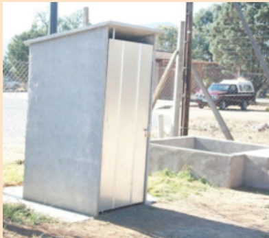
One of the completed ventilated improved pit toilets produced at the factory