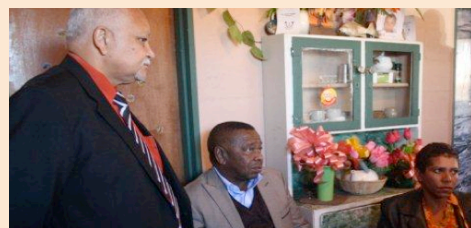
Cape Agulhas Mayor, Minister Blade Nzimande and Anene's foster mother

The Minister of Higher Education and Training, Dr Blade Nzimande, launched a R10 million construction skills development and job creation project in memory of Anene Booysen.