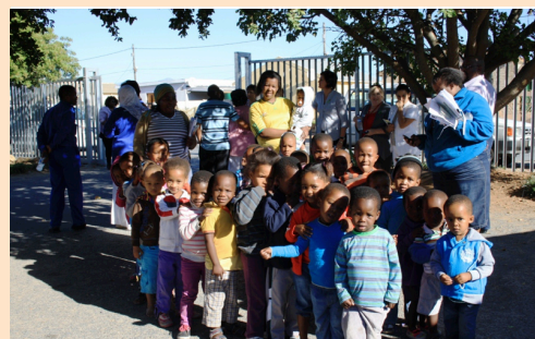
Children from a local crèche in Zwelethemba coming for immunisation at the Empilisweni Clinic in Zwelethemba, Worcester, as part of the Polio and Measles Campaign launch.

All adults can help to eradicate polio and measles by ensuring that all children under the age of five years receive this vital top-up immunisation.