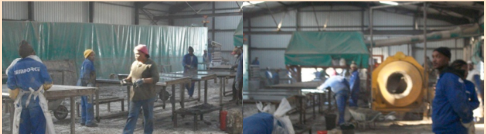
Beneficiaries on site hard at work in the factory in Queenstown

Hundreds of unemployed graduates, community members, local contractors, job seekers and entrepreneurs have begun reaping the benefits of a sanitation project that was initiated at the end of 2010. Thousands of ventilated improved pit toilet units are being installed across the Chris Hani District Municipality. The project focuses on constructing the toilet units and sourcing local construction material.