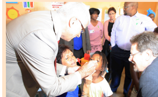
Children from the Zwelethemba in Worcester receive polio drops at the provincial launch event of the Polio and Measles Campaign on 30 April 2013.