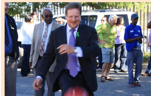
MEC Theuns Botha kick starts the Polio and Measles Campaign by kicking a ball in the air, which symbolically indicate of the start of the campaign.