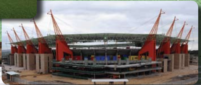
Mbombela Stadium, Nelspruit