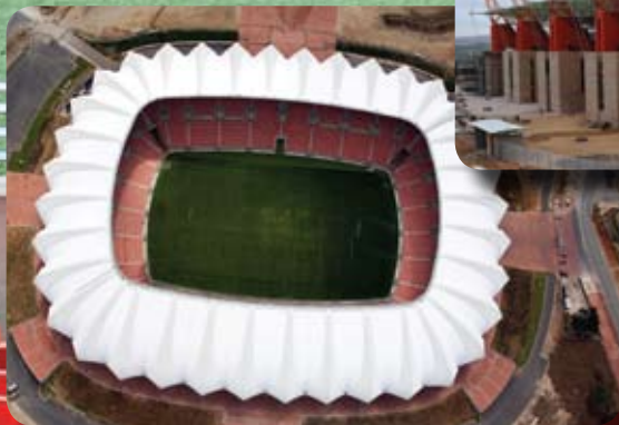
Nelson Mandela Bay Stadium, Port Elizabeth