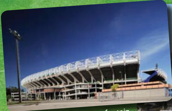
Free State Stadium, Bloemfontein