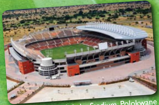
Peter Mokaba Stadium, Polokwane