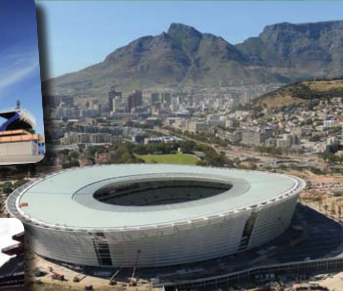
Green Point Stadium, Cape Town