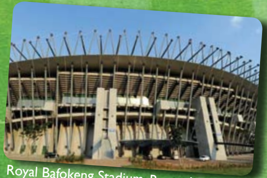
Royal Bafokeng Stadium, Rustenburg