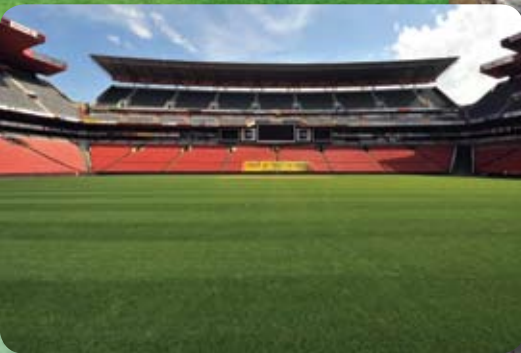
Coca Cola Park Stadium, Johannesburg