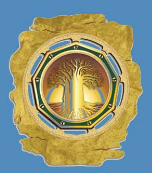
The Order of the Baobab