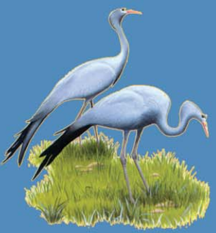
National bird: blue crane