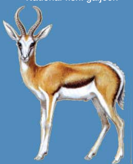
National animal: springbok