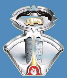
The Order of Mapungubwe