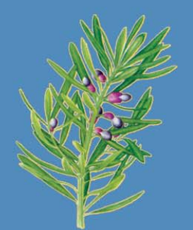
National tree: real yellowwood