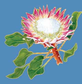
National flower: king protea