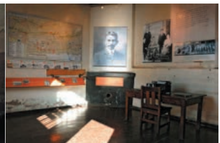
Mahatma Gandhi Exhibition

Address: 1 Kotze Street, Braamfontein, Johannesburg | Tel: 011 381 3100 | Fax: 011 381 3108 | E-mail: info@constitutionhill.org.za Website: www.constitutionhill.org.za | Constitution Hill (South Africa) | Contact_ConHill