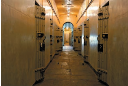
Isolation Cells - Old Fort