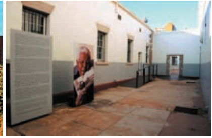
Prisoner in the Garden Exhibition— Nelson Mandela Courtyard

Nowhere can the story of South Africa's turbulent past and its extraordinary transition to democracy be told as it is at Constitution Hill. This National Heritage site has witnessed over a century of South Africa's history. From British soldiers who fought with the Boers at the turn of the century, the youths caught up in the Soweto Uprising, to the dawn of democracy and the building of South Africa's Constitutional Court, Constitution Hill has witnessed it all. Visit Constitution Hill and learn about the injustices of South Africa's past while observing the process by which freedom was won and is now protected. Exhibitions and guided tours have been designed as an interactive experience, offering visitors the opportunity to participate in the building of Constitution Hill.