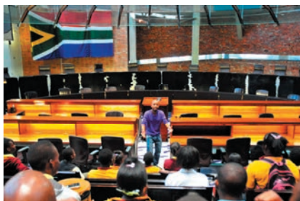
Scholars on tour at Constitution Hill

Visit www.constitutionhill.org.za to learn more about the Public and Educational programmes hosted at Constitution Hill!