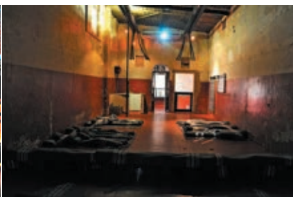
Life in a Cell Exhibition