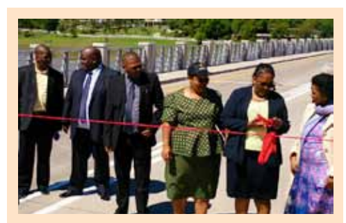
Minister Dipuo Peters officially opens the bridge near Keimoes on the R27.