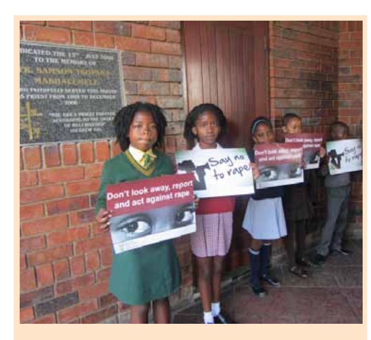
Learners participated in a silent protest to highlight the issues of rape and child abuse facing today's youth.

health-related problems; babies born with foetal alcohol syndrome; draining of the family unit's financial and emotional resources; teenage pregnancy; HIV and AIDS, sexually transmitted infections; and academic difficulties. South Africa is facing a myriad of challenges, but a drug-free South Africa is possible.