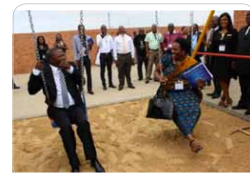
"The Grade Rs will enjoy the swing as much as we do," said the Premier.