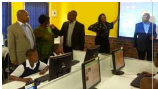
Free State Education MEC Tate Makgoe, Deputy Minister of Water Affairs Rejoice Mabudafhasi, MTN representative, Mangaung Metro Deputy Executive Mayor Connie Rampai and Executive Mayor Thabo Manyoni.