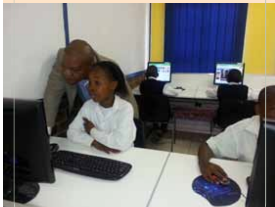
Free State Education MEC Tate Makgoe reading what the first-time computer user typed on the screen.