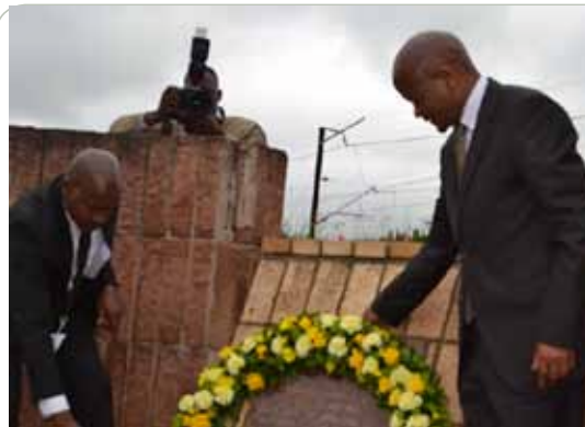
Premier places flowers of remembrance as a symbol to honour the struggle. He said the Provincial Government would put measures in place to ensure that this very important site where Madiba was captured does not get vandalised.

By Mlungisi Dlamini: GCIS, KwaZulu-Natal