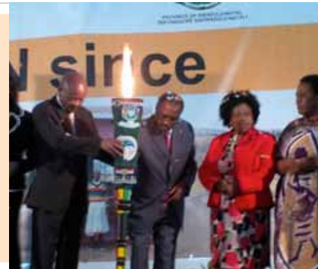
The Premier of KwaZulu-Natal, Senzo Mchunu, accompanied by MECs officially light the 20 Years of Freedom Flame.