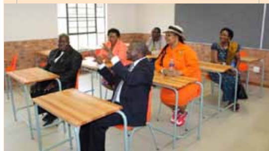
Back to school for the Mpumalanga MECs, the principal and Pixley Ka-Seme Municipality members experiencing the convenience of the newly built classrooms first-hand.