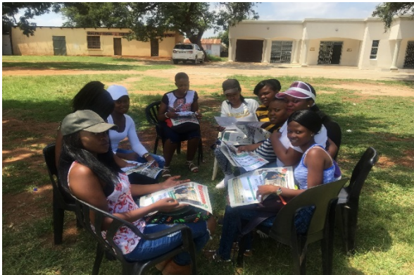
Learners at Kwa Fene Tribal Authority