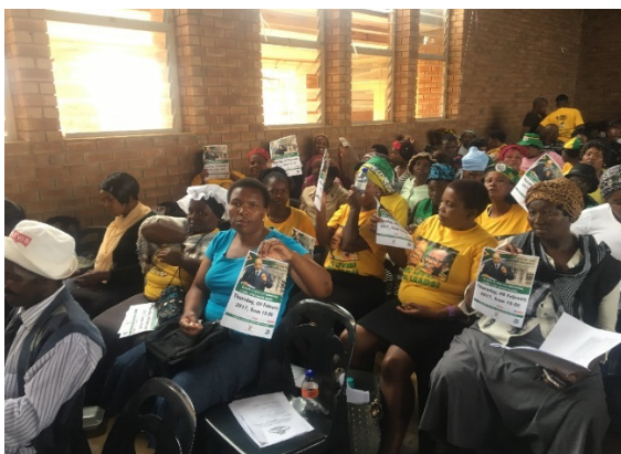
Members of the public during the Nkangala District Municipality Outreach meeting at KwaMhlanga Community Hall.