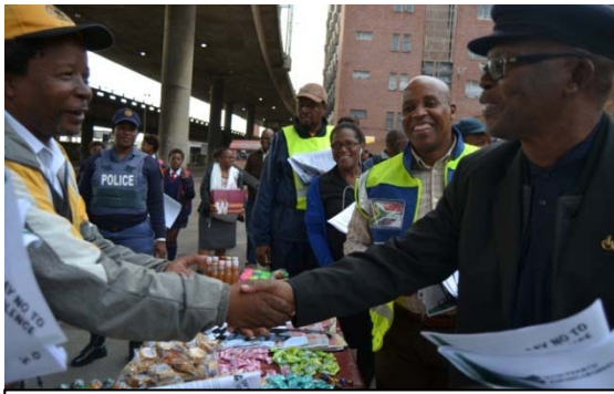
Premier and Executive Mayor interacting with hawkers at the taxi rank in Port Elizabeth