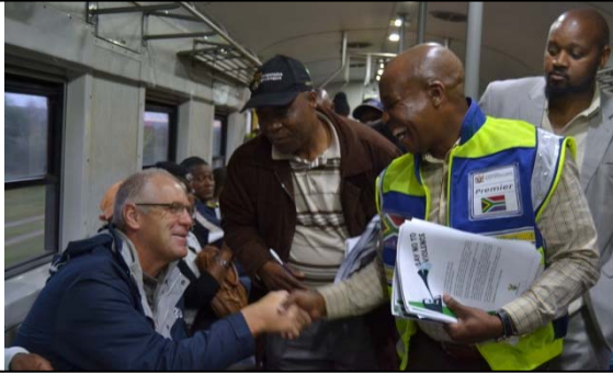
More engagement in the train