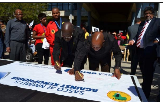
The march at the University and Premier with Executive Mayor adding their signatures for solidarity against against xenophobia