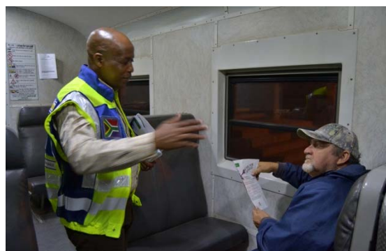
Premier's arrival and engagement with first person to board the train in Uitenhage station