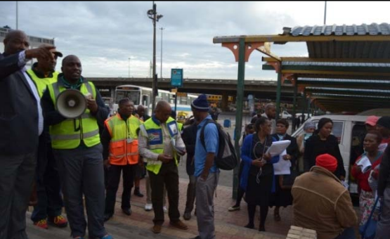
Premier and interaction with taxi drivers and commuters