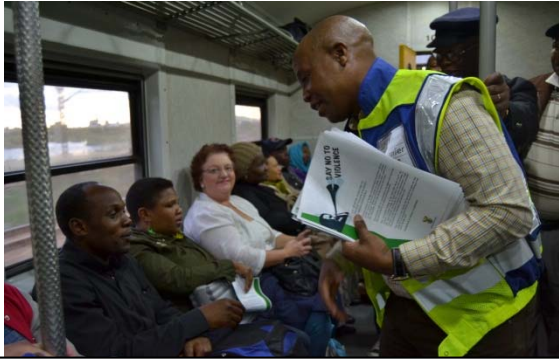
Premier engaging commuters of all races in the train