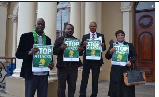
More interaction with NMBay citizens and demonstration by some of the members of the NMBay task team on anti-xenophobia