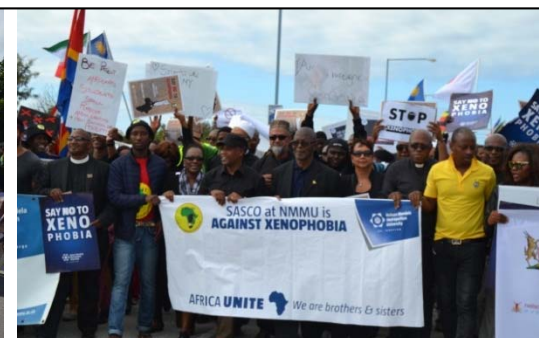
The start of the march at Nelson Mandela Metropolitan University in PE