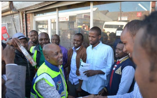
Blitz and interaction with owners of shops in Durban Road, Korsten who are foreign nationals