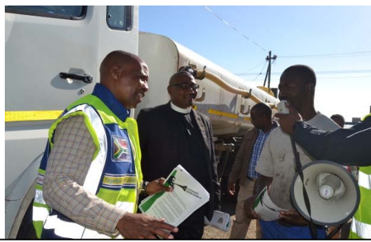
Blitz and interaction at Durban Road, Korsten