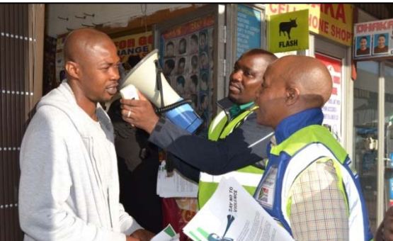
Premier and Executive Mayor interacting with people in town and shop owners in Port Elizabeth