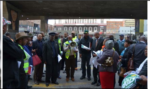
Media door stop and Premier addressing the team for the outreach