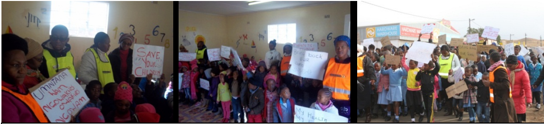
Child Abuse dialogues with Little Angels Community School and Street March at Cofimvaba Main Road

AUTHOR: Vuyani Sibene, GCIS-Eastern Cape