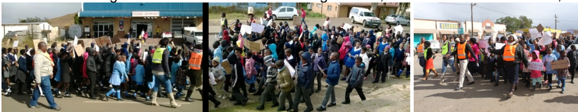
During the march in Cofimvaba streets

The main messages of the march were "Don't Neglect Me", "I'm the future Protect Me", "Kwanele".