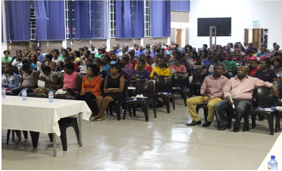
University community in attendance.