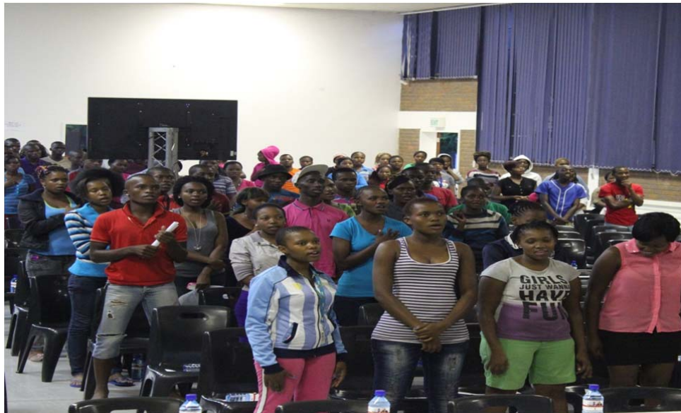
Students singing the National Anthem.