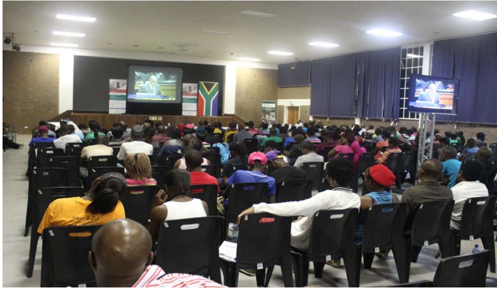
University community in attendance.