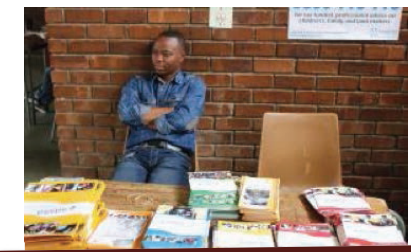
Some of the exhibitions from the Department of Social Development and the South African Social Security Agency during the outreach.

The community members were given the opportunity to ask respective institutions questions to clarify issues. They also got the opportunity to be served at the mobile clinics.