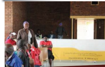
Members of the community seeking clarity on issues during the question time.