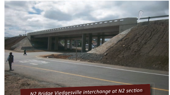
N2 Bridge Viedgesville interchange at N2 section 18 between Sitebe Komkhulu and Viedgesville.