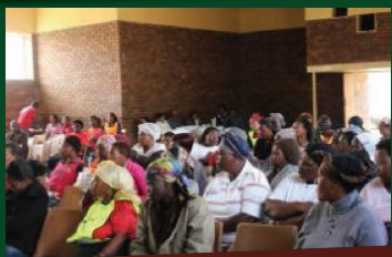
Community of Kwa-Dela attendance the outreach in great numbers.