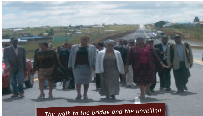
The walk to the bridge and the unveiling of the plaque.