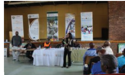
The Department of Social Development's social worker presenting the social development programmes.