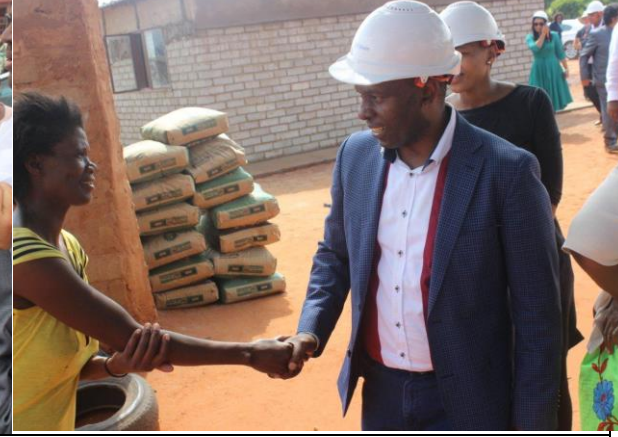
Acting Minister greets one of the housing project beneficiaries during house hold visit.