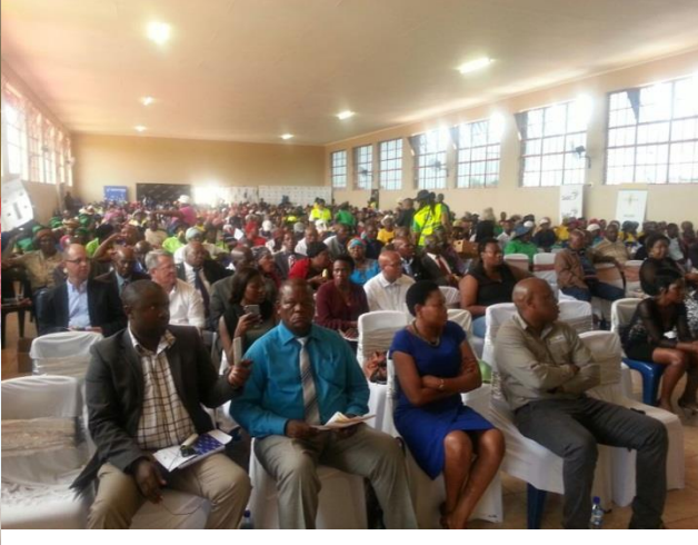
Audince listen attentively to the Minister's speech.