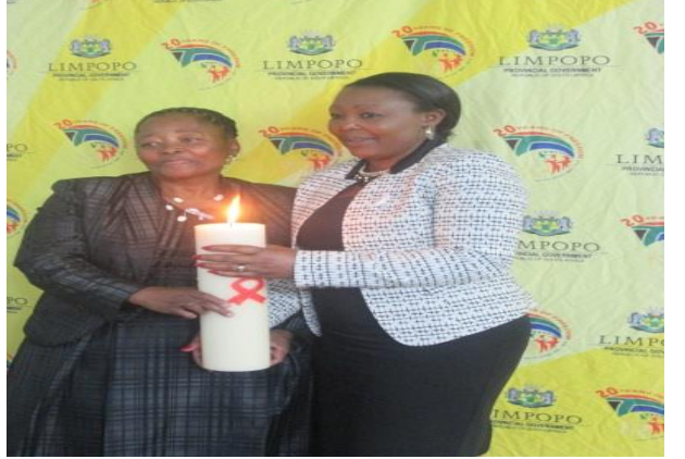
Executive Mayor of Waterberg with the MEC for Safety, Security and Liaions during the candle lighting moment as part of the provincial launch of 16 days of activism on the 25 November 2014