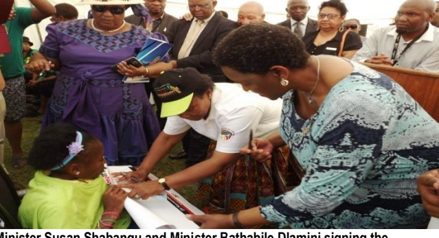
Minister Susan Shabangu and Minister Bathabile Dlamini signing the the memorandum with MEC Sisi Ntombela looking on

Children marching through the streets of Frankfort to deliver their "Count Me In" Memorandum