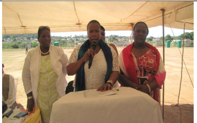
The mayor of Elias Motsoaledi Local Municipality during 16 days of activism of no violence against women and children at Ntwane village on the 04 December 2014.