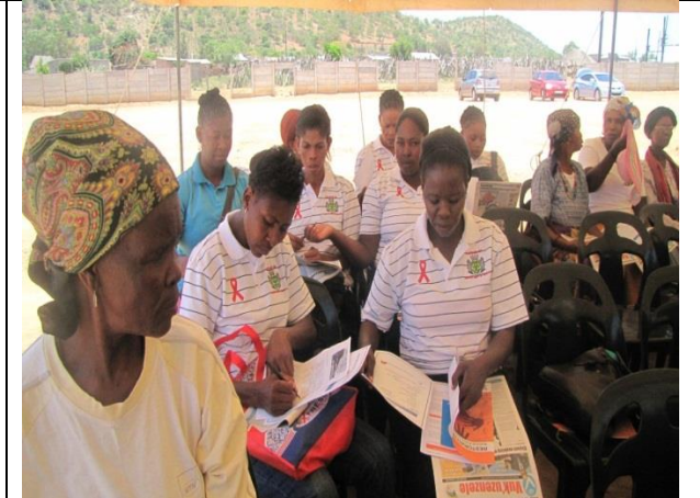
Part of the community members during 16 Days of Activism of no violence against women and children at Ntwane village, Elias Motsoaledi Municipality on the 4 December 2014.