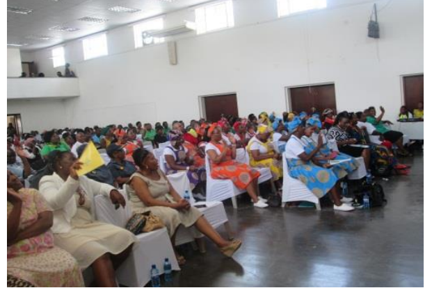
Community members during the launch of 16 days of activism at OR Tambo community hall at modimolle on the 25 November 2014