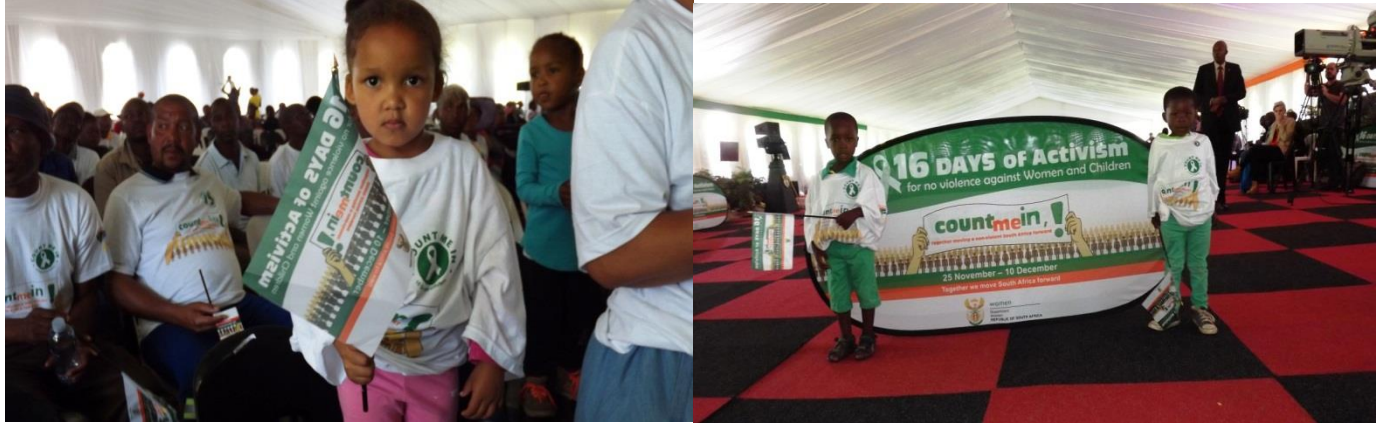
Reigerpark young and old came in numbers to witness the launch of 16 Days of Activims for no violence against women and children and to be counted in