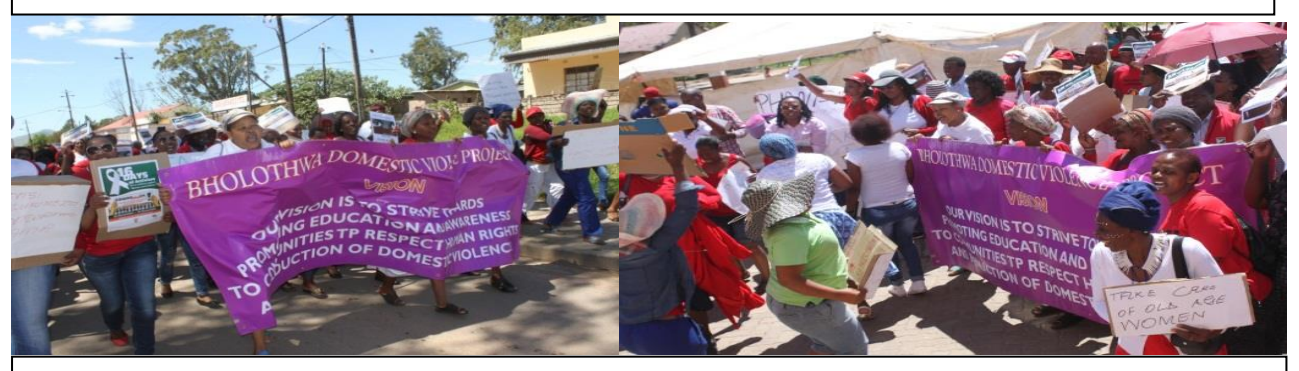
Intsika Yethu march marking the closure