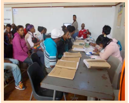
The Department of Rural Development and Agriculture informed community members about food security.