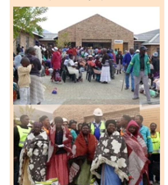
Senior citizens came in numbers to support the good cause and were given blankets.