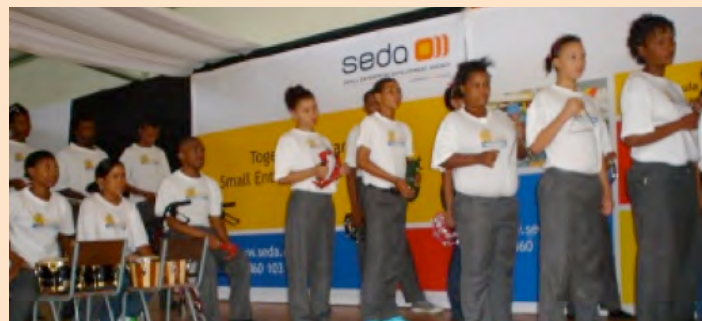
The Oasis school for the disabled rendering a musical piece.