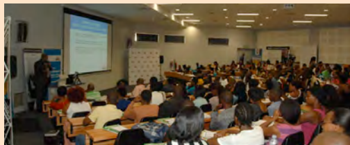
Student community of the WSU during the Brics roadshow engagement session at the Berlin campus