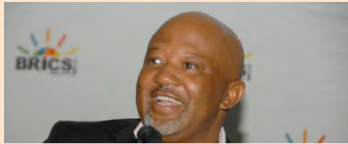
MEC Mcebisi Jonas sharing potential investment opportunities in the Eastern Cape. These are opportunities available to Brics counties to unlock provincial economic potential.