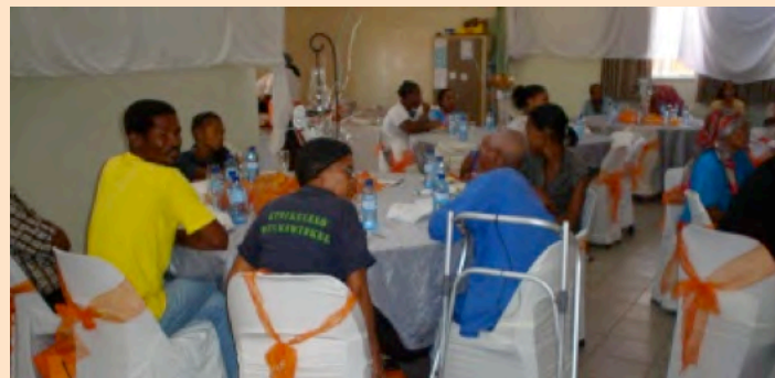
People living with disabilities at the event.