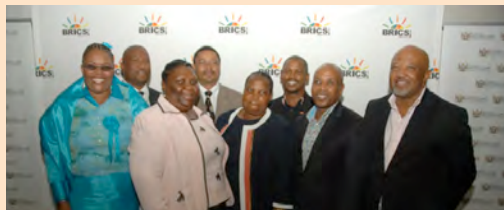
Premier Noxolo Kiviet and members of the executive council during EC-Brics stakeholder engagement session in East London.