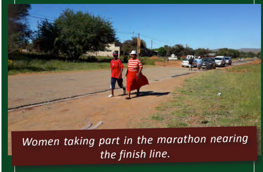
Women taking part in the marathon nearing the finish line.