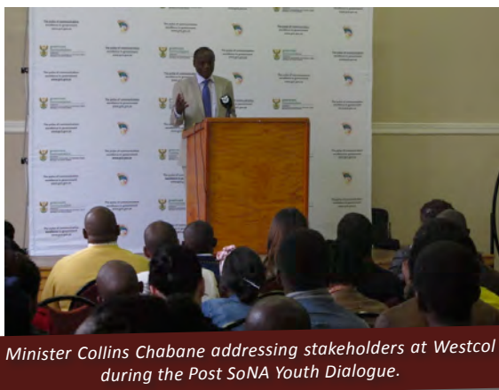
Minister Collins Chabane addressing stakeholders at Westcol during the Post SoNA Youth Dialogue.