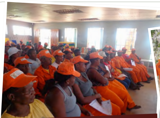
Participants in the CWP in Mapoteng at the information sharing session.

By Kgalalelo Motsage: GCIS, Northern Cape