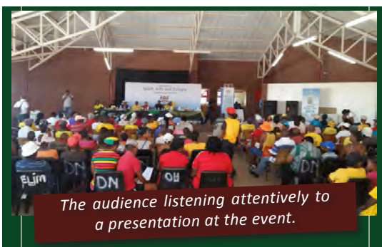
The audience listening attentively to a presentation at the event.