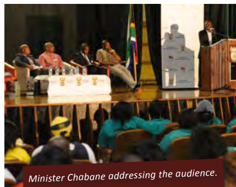
Minister Chabane addressing the audience.