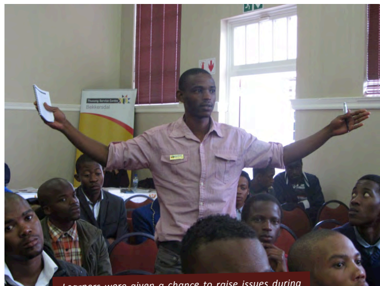
Learners were given a chance to raise issues during the dialogue.

On Friday 14 March 2014, GCIS Gauteng hosted a post-SoNA Youth Dialogue lead by Minister Collins Chabane at Westcol Corporate Park Office with a select number of learners from various campuses in the West Rand. The event provided an opportunity for learners from Westcol to interact with the Minister regarding issues raised during the State of the Nation Address (SoNA) delivered by President Jacob Zuma on 13 February.