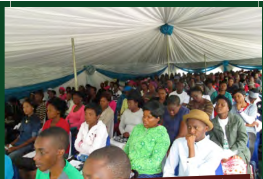
Part of the crowd during the launch of the Passport to Future project at Mapodile Thusong Service Centre on 9 April.