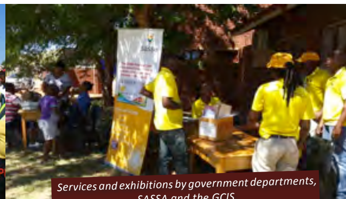
Services and exhibitions by government departments, SASSA and the GCIS.

The communities of Olifantshoek and Deben in the John Taolo Gaetsewe District, Northern Cape, celebrated Human Rights Day with life-changing and positive prospects as part of the event's theme.