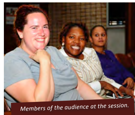
Members of the audience at the session.