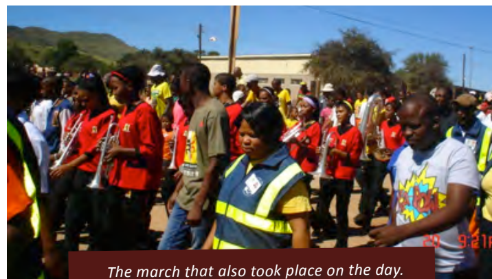
The march that also took place on the day.