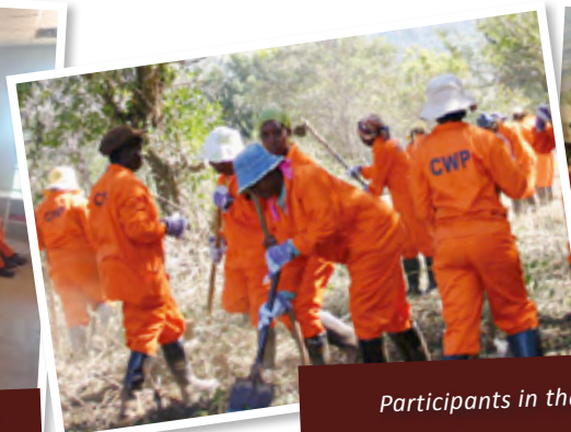
Participants in the CWP hard at work.