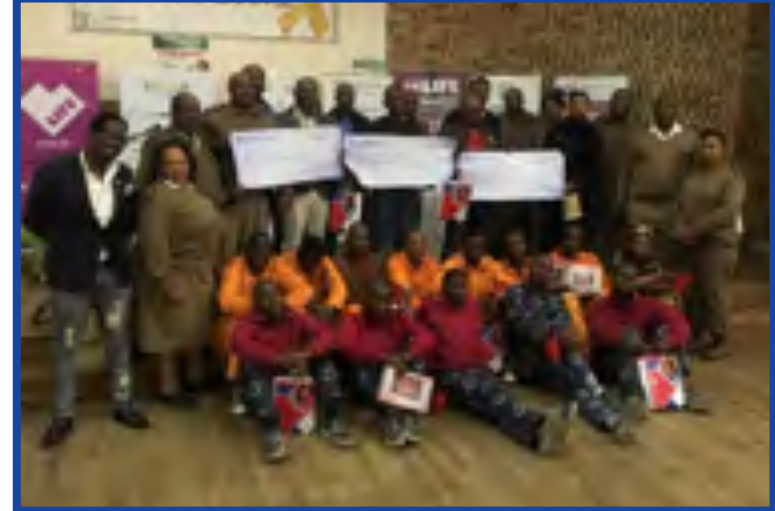
Beneficiaries of the grant and offenders who won prizes during the event.

Witbank Correctional Centre celebrated Youth Month with 200 young offenders. The National Youth Development Agency (NYDA) and Government Communication and Information System together other stakeholders joined together to bring hope to young offenders. The programme started in 2015 after realising that the ex-offenders were not getting much support when they are released from correctional centres after serving their sentences. It was realised that most of them regress and end up committing crime again as they feel that communities are not welcoming.