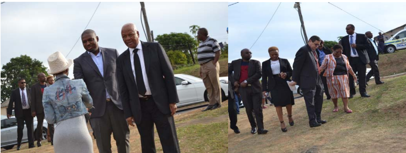
ABOVE: Left – Deputy Minister Manamela and Minister Hadebe being welcomed to the Dlamini Household by a family member. Right - Ministers Masutha and Zulu together with Deputy Minister Landers and eThekweni Deputy Mayor Shababala as they make their way to the Dlamini