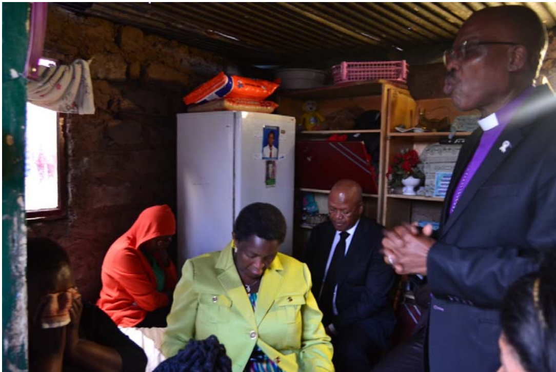
A prayer for the departed soul and comfort and strength for the family.