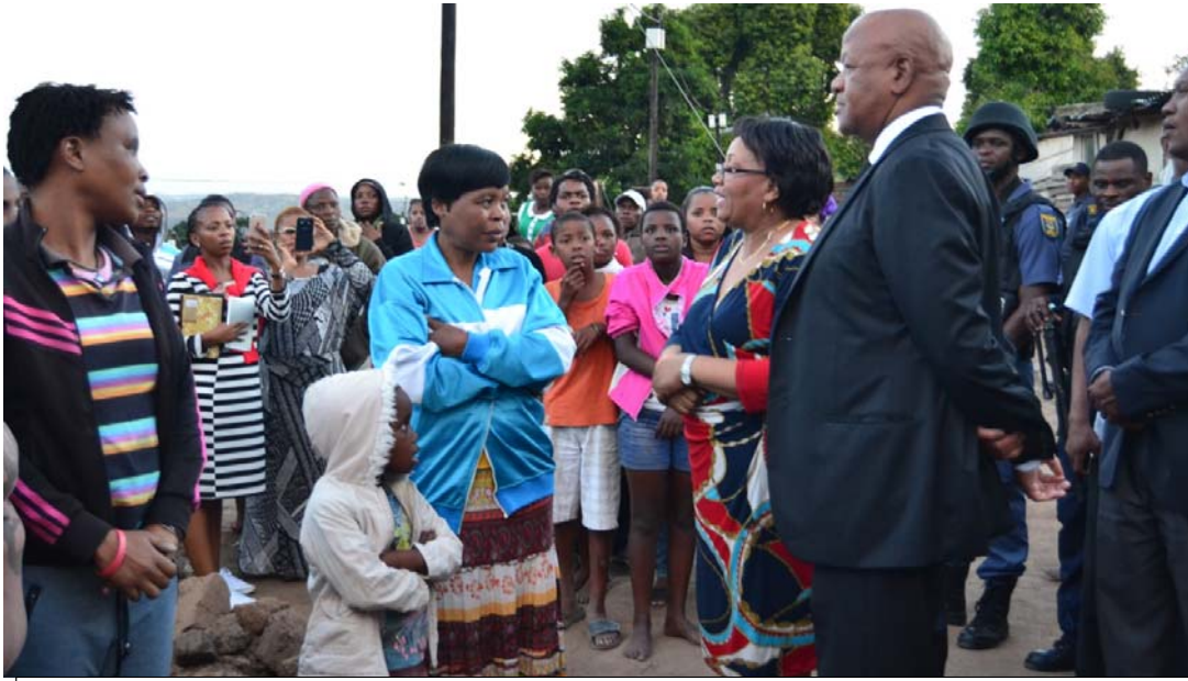
Minister engage with the community.