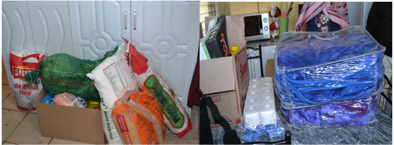
The IMC also came with groceries that were given to the bereaved families together with a cheque of R10000 per family.