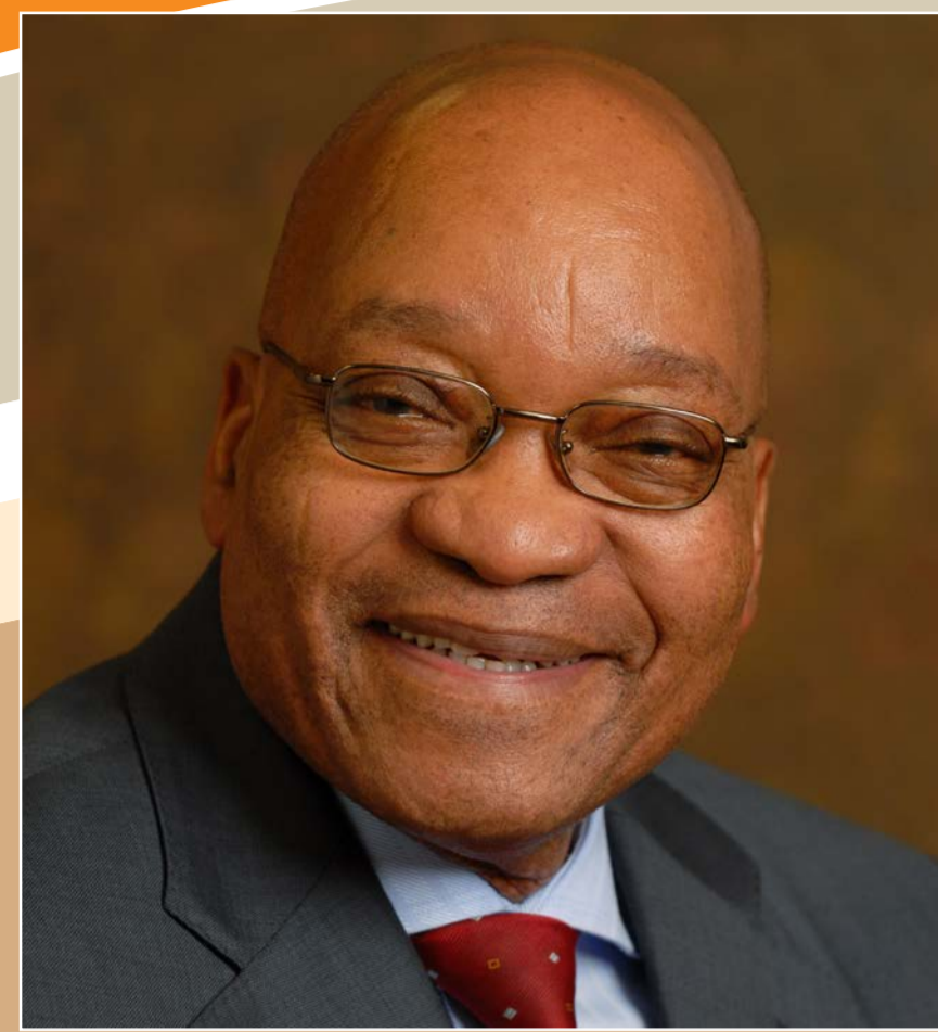
President Jacob Gedleyihlekisa Zuma

Mr Jacob Gedleyihlekisa Zuma was born in KwaNxamalala in Nkandla, KwaZulu-Natal on 12 April 1942. In 1958 he joined the African National Congress (ANC) and became an active member of the ANC's armed wing, Umkhonto we Sizwe. He was arrested in 1963 and sentenced to 10 years' imprisonment on Robben Island. He held various positions in the ANC after his release and was elected deputy secretary-general of the ANC in 1991.