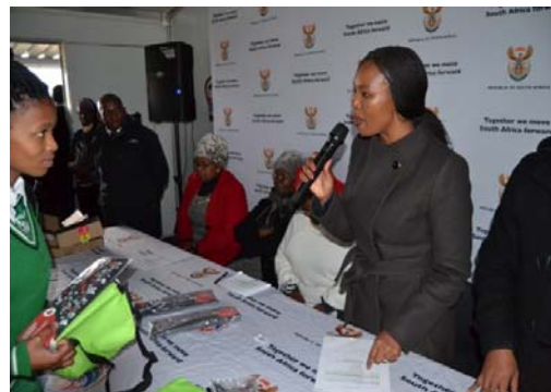
Deputy Minister handing over sanitary towels ,calculators and lunch pack bags to learners