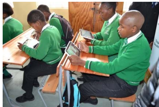
Deputy Minister of DOC officially handing over the Cyber Lab at Ngubeszwe SSS with tablets to inspire learners to put education first