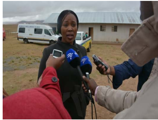
Media interviews with SABC TV and Umhlobo Wenene FM