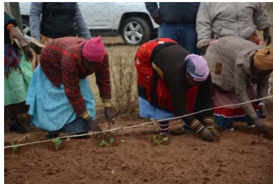
Deputy Minister planting the seedling with members of community to encourage them to be agents of the change they want to see and defeat poverty