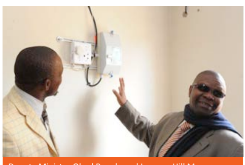
Deputy Minister Obed Bapela and Ingquza Hill Mayor, Mdingi at the Lubala symbolic electricity switch-on.

The Government Communication and Information System (GCIS) undertook to make concerted efforts in supporting the creation and facilitation of communication platforms between members of the Executive and the public to afford political principals opportunities to experience first-hand information on government progress and forge strategic partnerships with communities. The post-SoNA information seminar was held at Lusikisiki College where various stakeholders in Ingquza Hill were able to engage in a dialogue in shaping the development of the community.