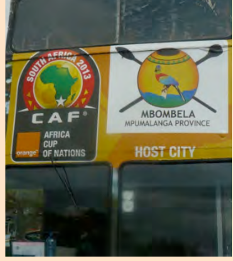
The back of the branded bus with matches for the Mbombela line-up.