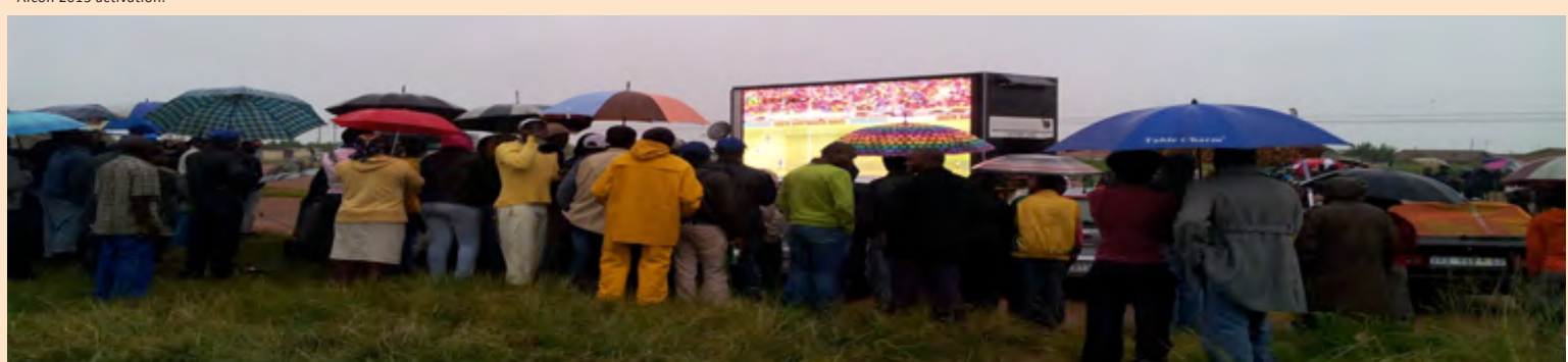
Daveyton residents at Afcon public viewing Zenzele sport grounds on 19 January 2013.