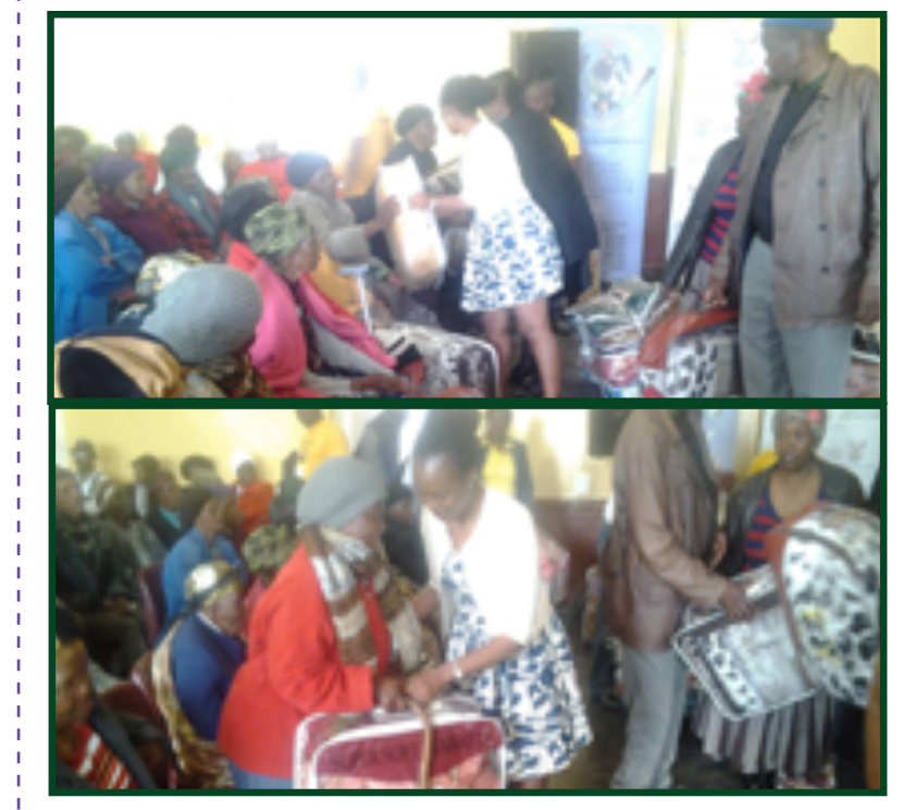
Deputy Minister Ndabeni-Abrahams presenting blankets to senior citizens.