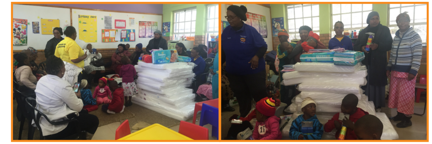
Teachers, parents and children at the Early Childhood Development Centre in Kimberley.