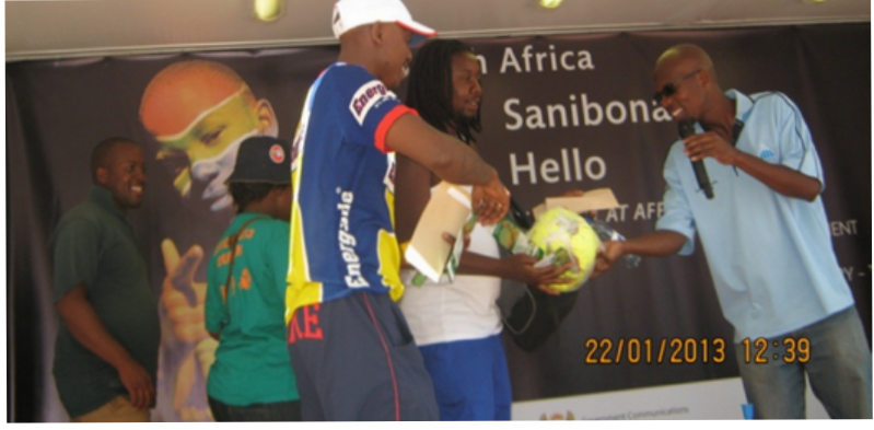
KwaZulu-Natal dancing to the Afcon beat.