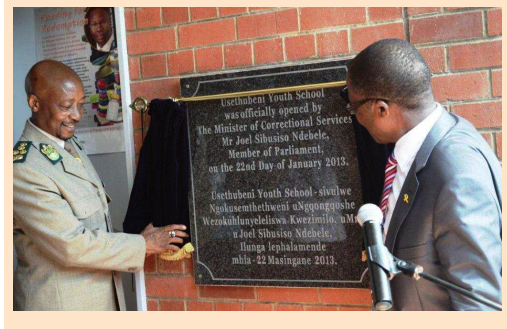
Minister Sibusiso Ndebele officially opening the Usethubeni Youth School, assisted by Commissioner Tom Moyane.