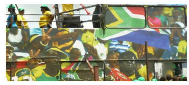
Residents from Msukalingwa Local Municipality in Ermelo, Mpumalanga, showing their support

South Africa is proud to be the host of Orange Afcon 2013, despite the exit of the national team from the tournament. With only few days left before the end of the Afcon tournament, South Africans – young and old - continue to support Afcon, which is regarded as a way of unifying the African Continent.