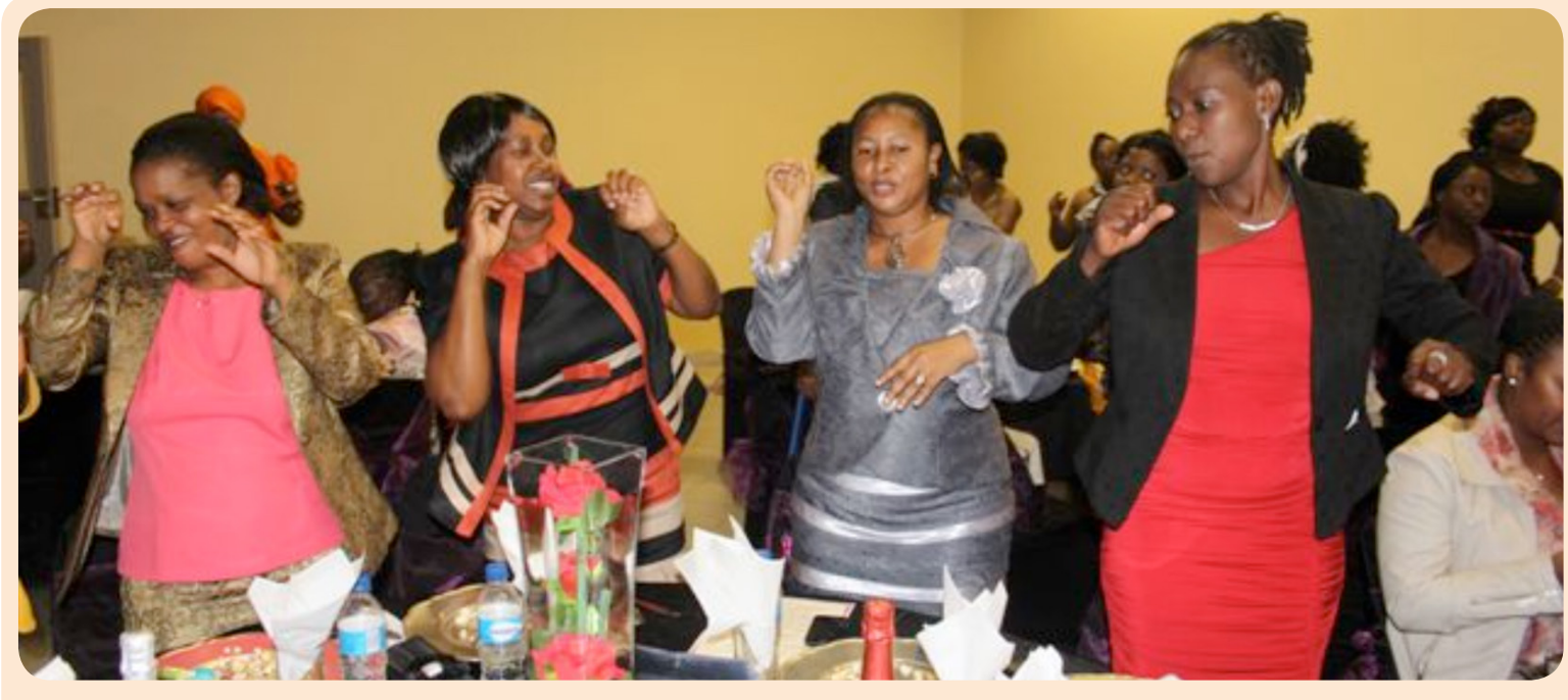
Women were dancing as part of the happiness therapy.

In line with the Women's Month theme, "A Centenary of Working Together Towards Sustainable Women Empowerment and Gender Equality", the Maphuta Malatji hospital management, staff and women from various institutions in Ba-Phalaborwa area celebrated the historic day in style.